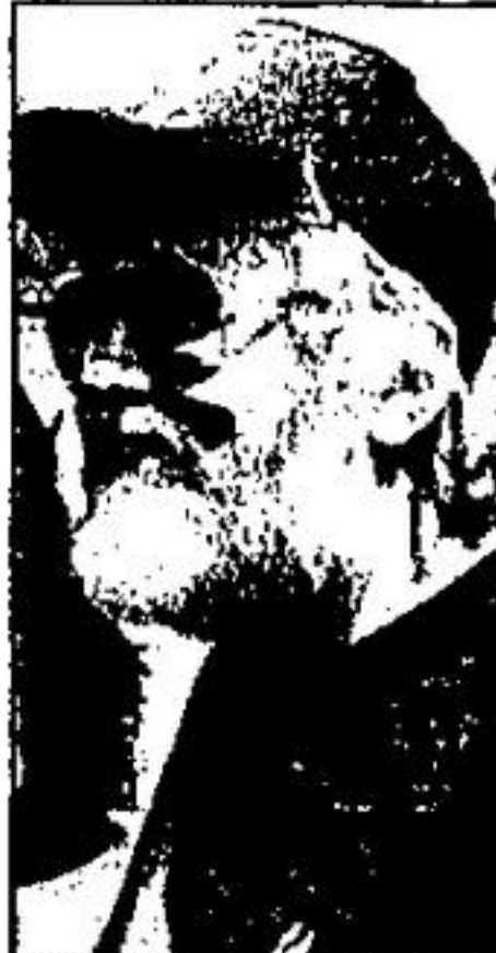
RONNIE HAWKINS $40,000. Organizers are hoping for 5,000 people to attend. Tickets are now on