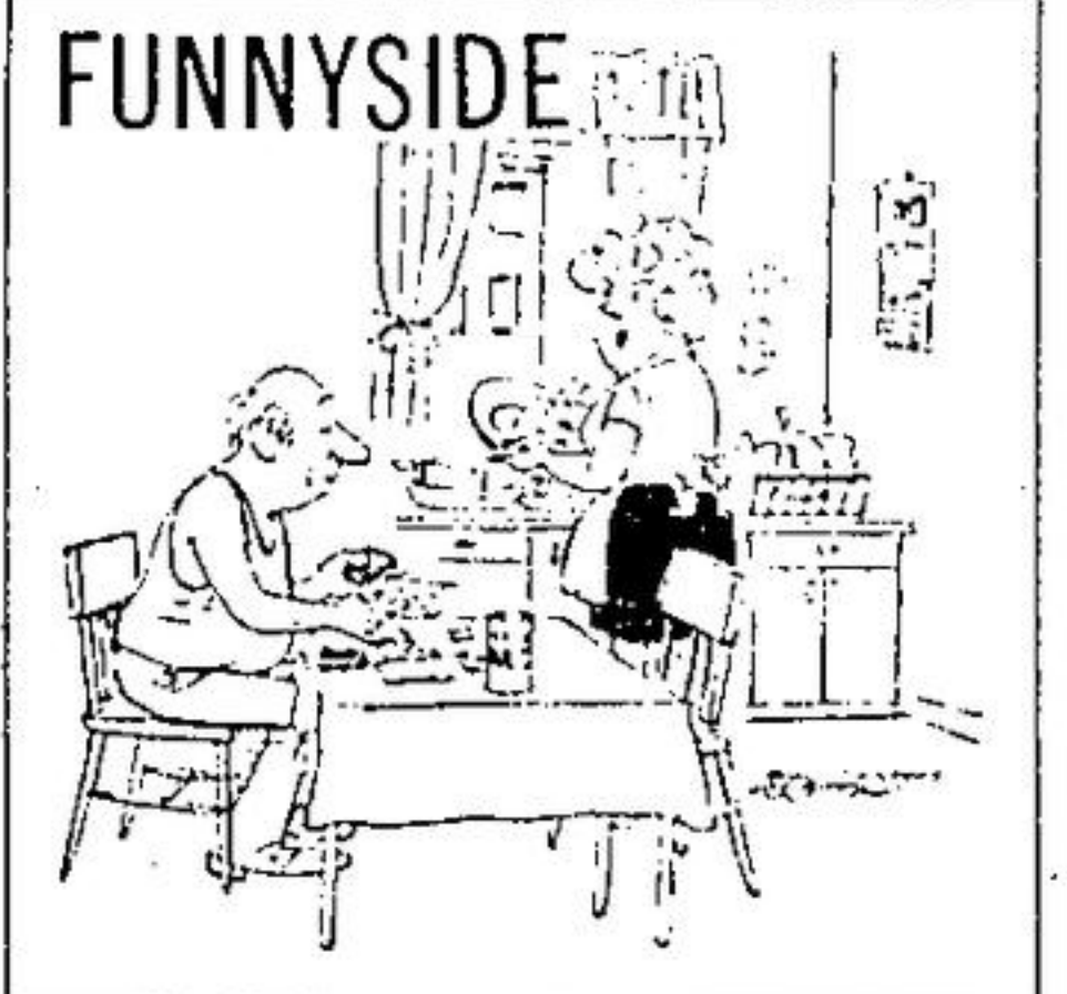
"Quite whistling that dirty song!"