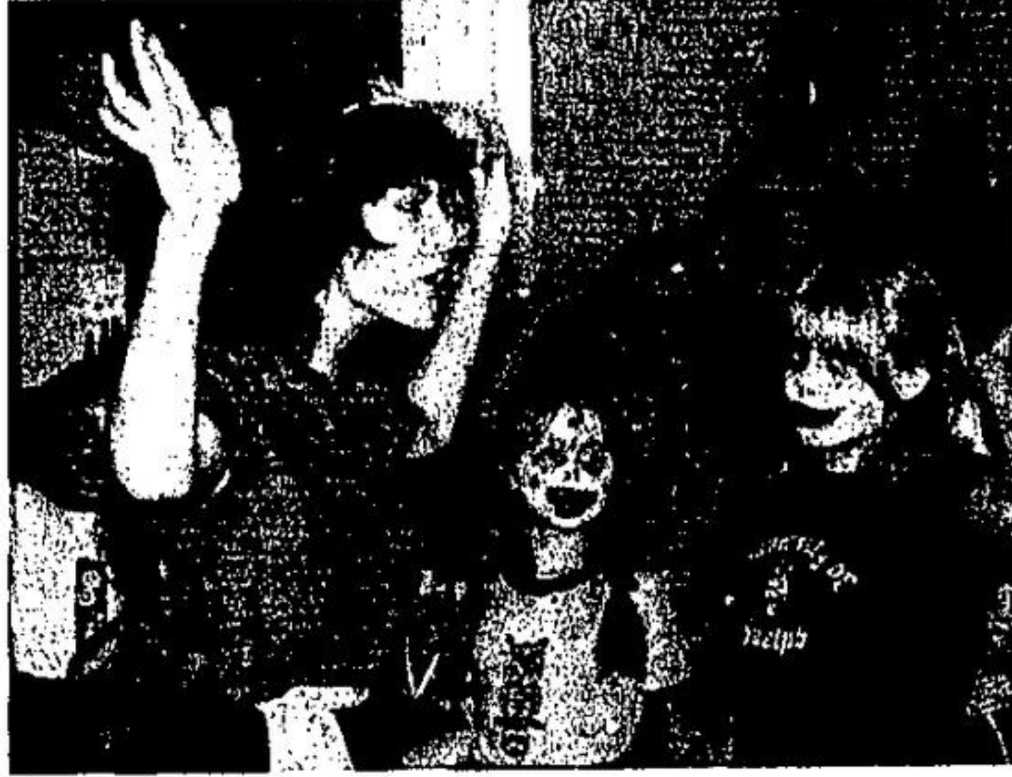
The town hall turned into a fish pond Saturday as youngsters joined in the adventures created by the acting duo called the Travelling Trunks.