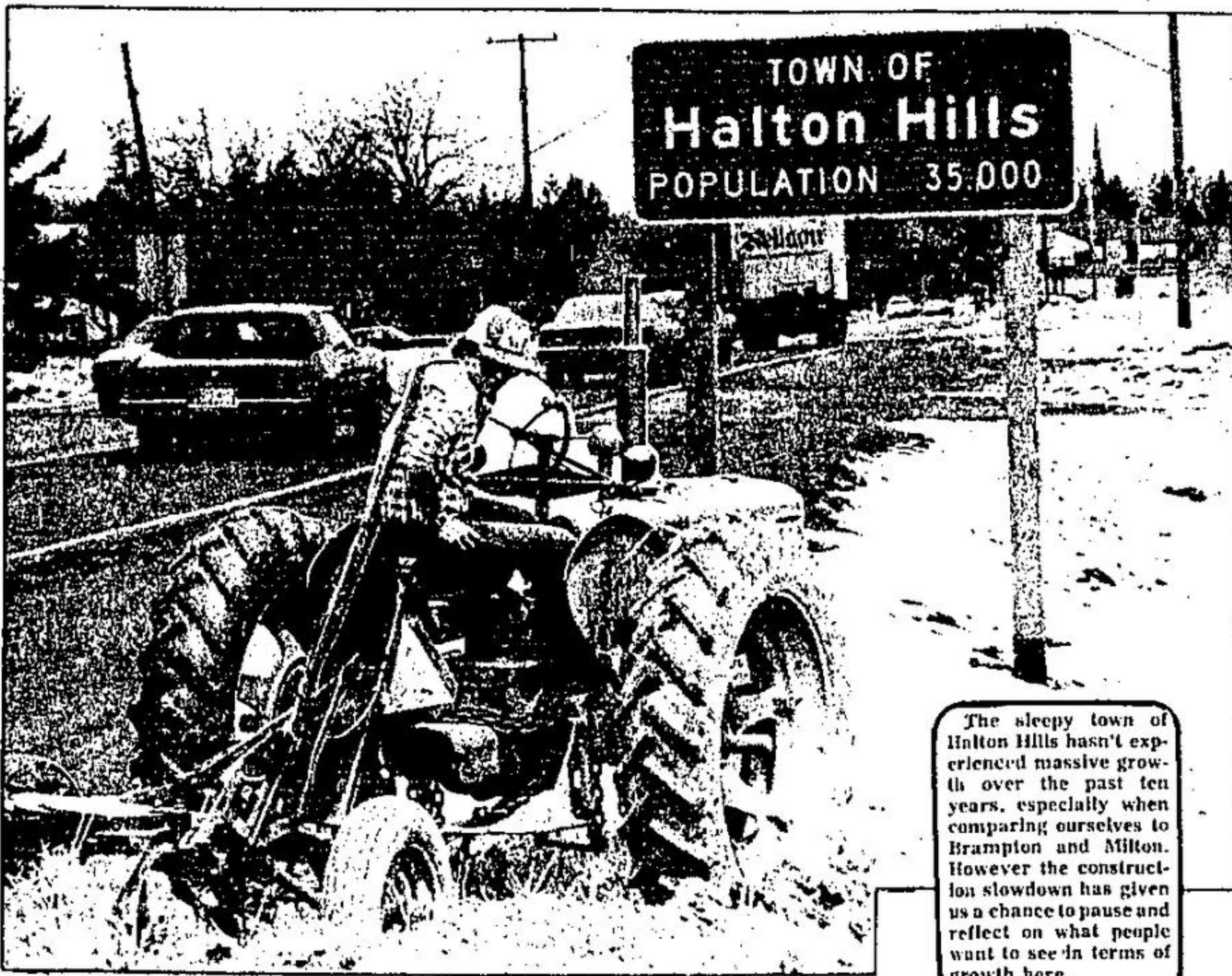
The sleepy town of Halton Hills hasn't experienced massive growth over the past ten years, especially when comparing ourselves to Brampton and Milton. However the construction slowdown has given us a chance to pause and reflect on what people want to see in terms of growth here.