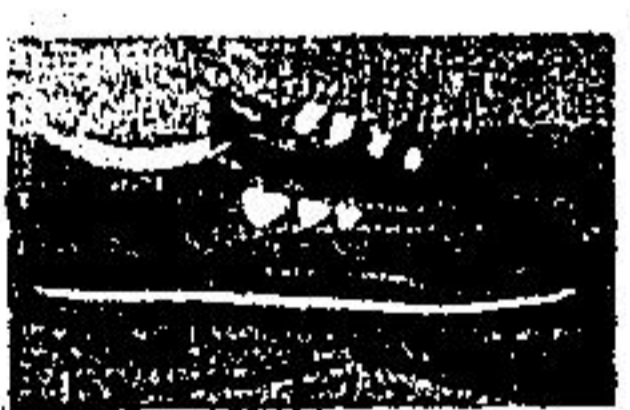
HART TO HART $15 98 Size 6-12 . . . . .