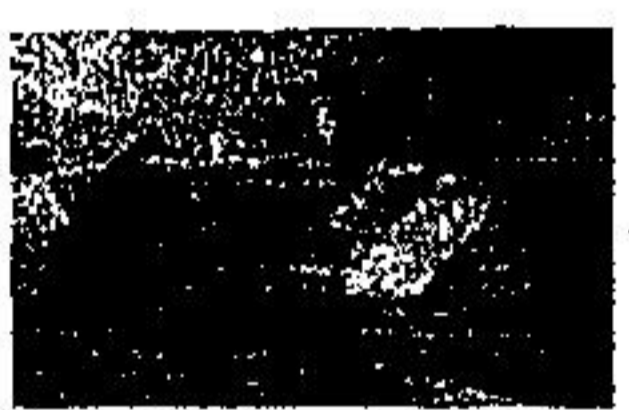
SHERBERT $14 98 Size 10 1/2-4 . . . .