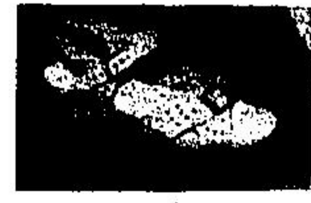
JEANIE $21 98 Size 13-4 . . . . .