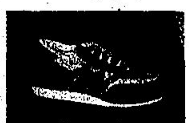
POWERCAT $26 98 Size 12 1/4-4 . . . .

Come in and check our excellent selection. Complete size range from tots to youths now in stock. Widths: narrow, medium, wide and extra wide.