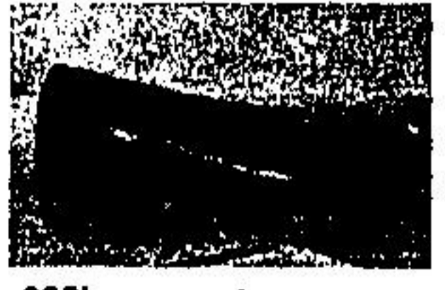
COOL $28 98 Size 10-12 and 12 1/2-4 . . . . .