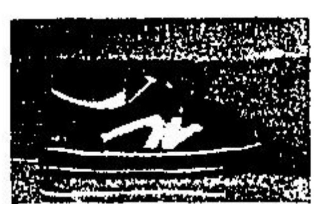
WILDCAT $16 98 Size 7-12 . . . . .