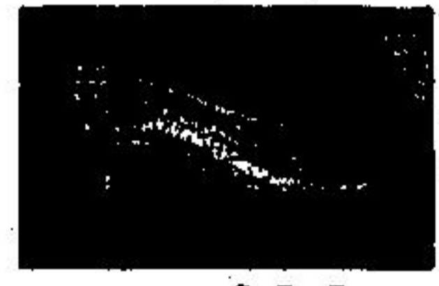
DUSTY $29 98 Size 13-4 . . . . .