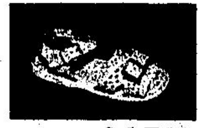
SEASIDE $17 98 Size 6-12 . . . . .