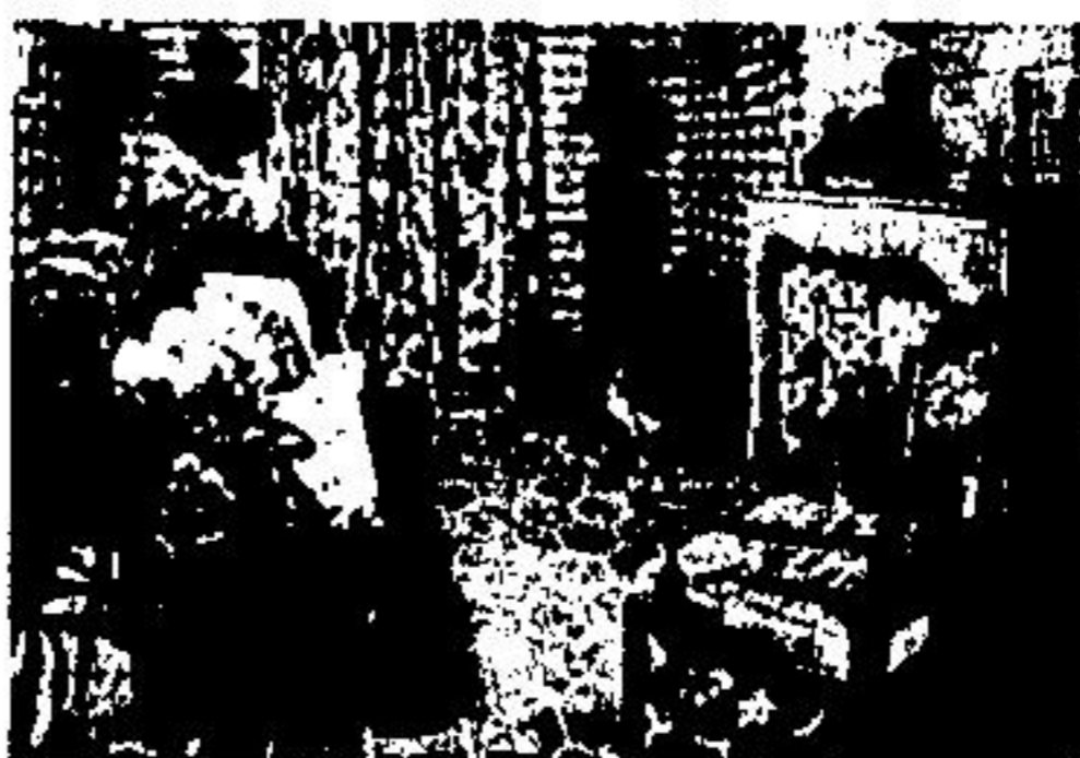
TERRA COTTA TILES from Il Ferrone make the floor on this sitting room a hidden heat-saver. Tile is a passive solar energy conductor, is fireproof and is easy to clean.

9. What can you do yourself? A basic bathroom remodeling job with new fixtures will cost $6,000