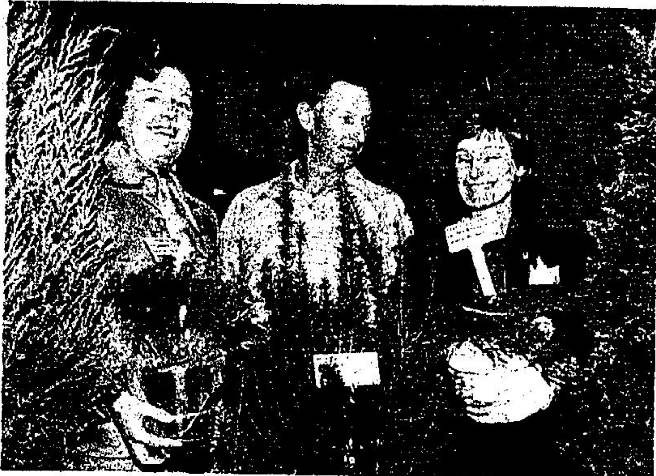
One sure sign that spring is in the air is when the community starts thinking about planting their gardens. Two ladies from Royal City organized a garden demonstration and talk by Art