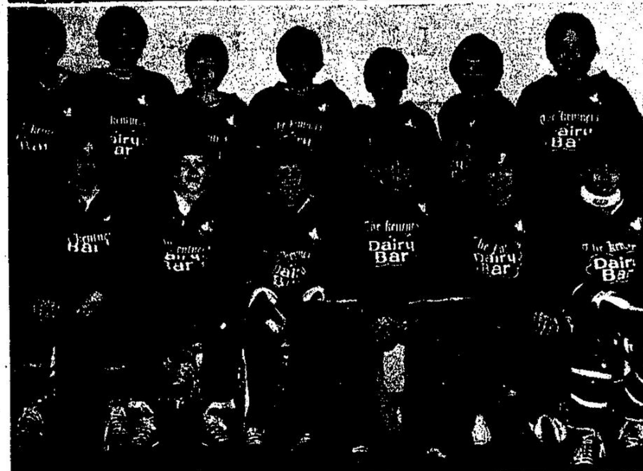
KENTNER'S DAIRY BAR