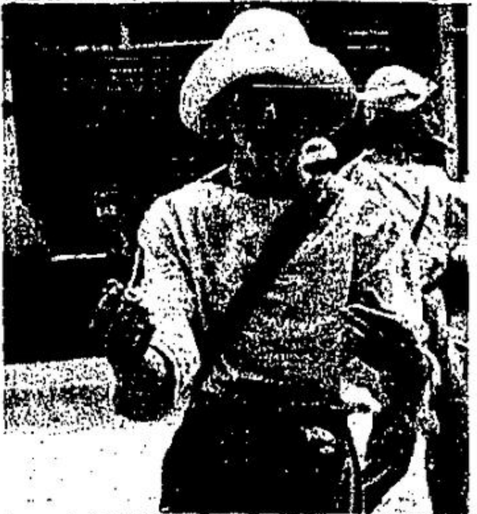
A juggler with the Dr. Bandoli Travelling Good Time Show delights visitors to downtown Georgetown during June's Pioneer Days.