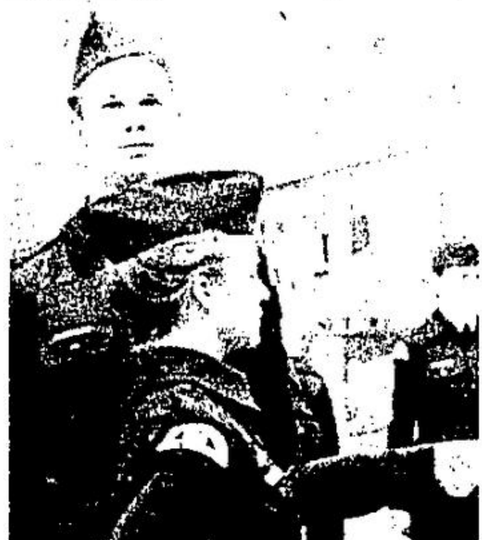
Georgetown's 756 Squadron air cadets are visible at various events throughout the year.