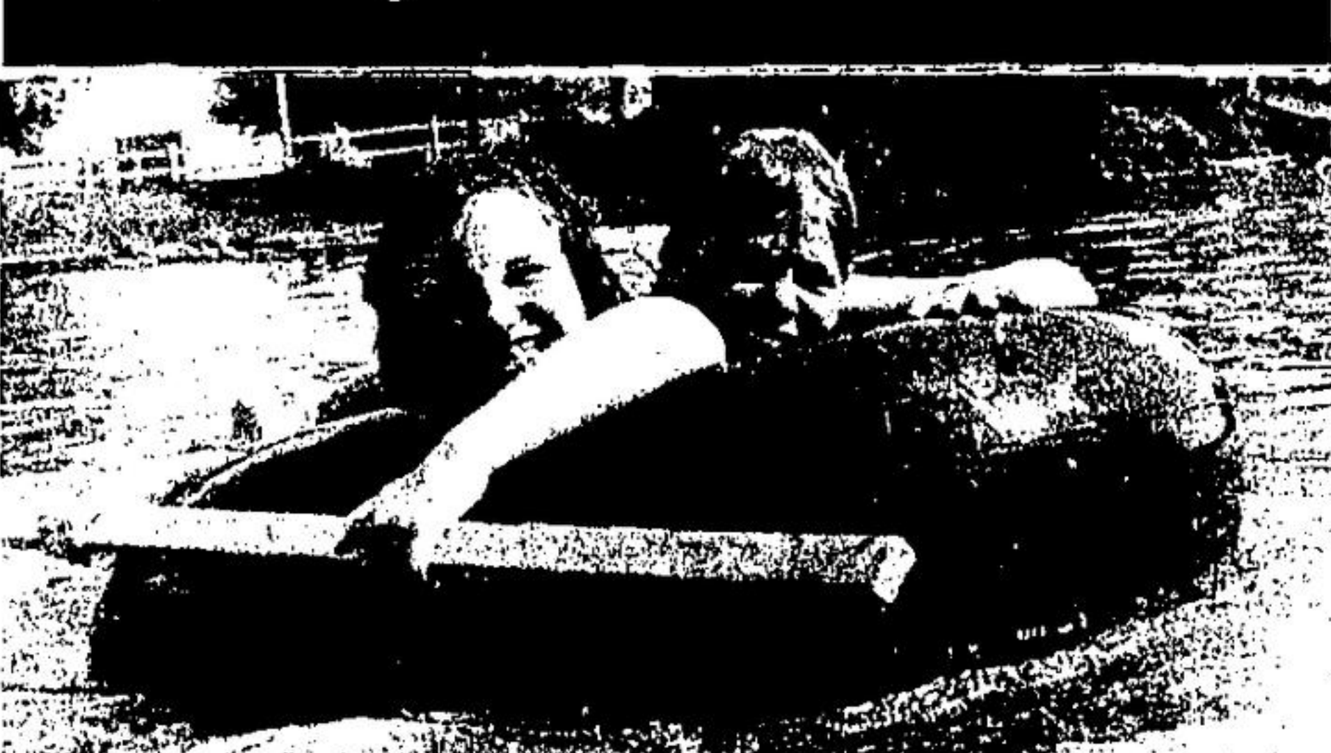
It may be minus 15 degrees outside now, but back in July there were the lazy, busy days of summer, and tub floating on Acton's Fairy Lake.