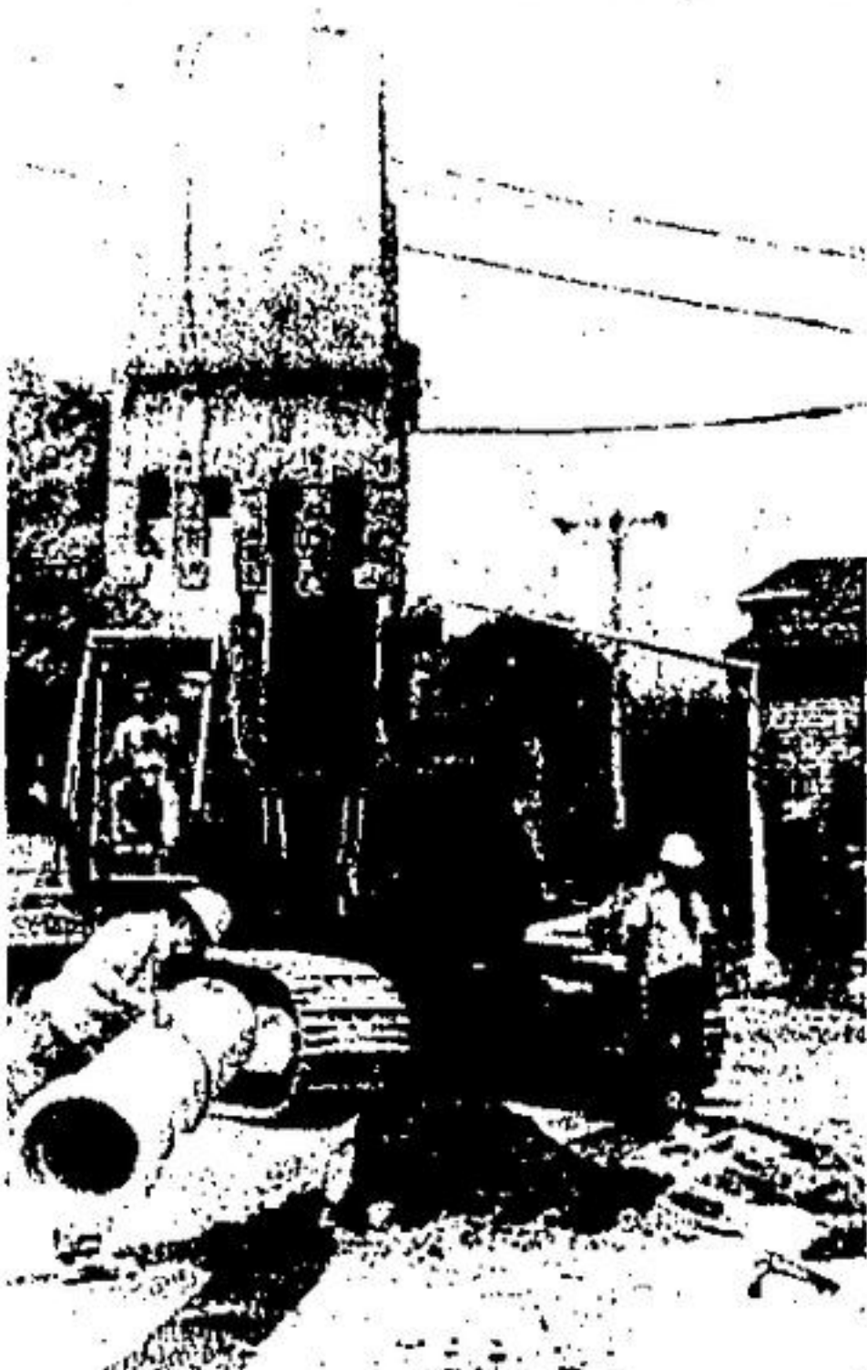
Mill Street, Georgetown is reconstructed between Main and Mill Streets as part of a downtown improvement project.