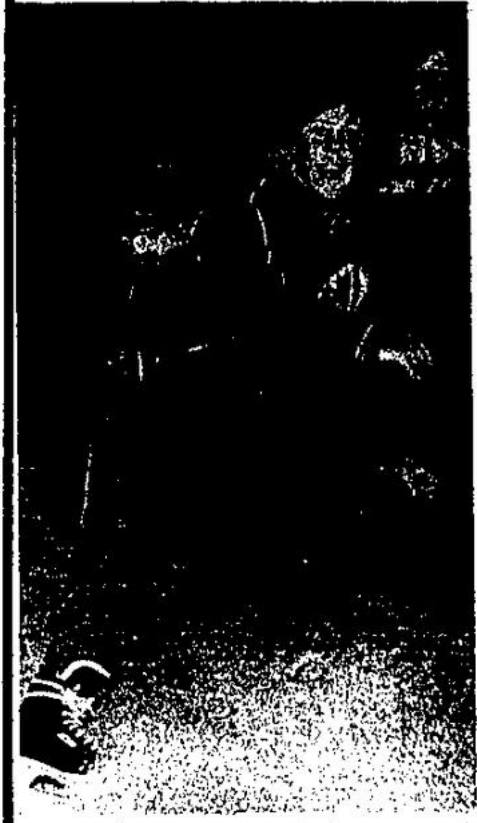
Tom Rasmussen's fast stop at the blueline indicates he's quite a hockey player. He's also a whiz during public skating hours, embarrassing slower and more awkward skaters.

WEDDING BELLS IN CONTACT THE YOUR FAMILY? HERALD AT 877-2201.