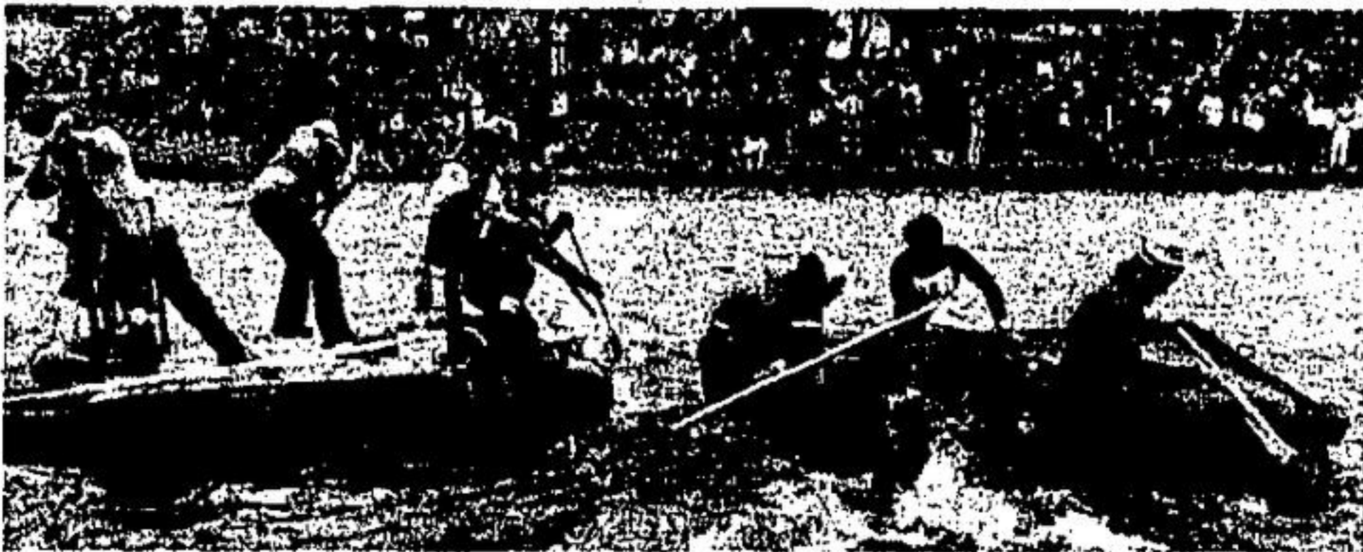
Challenging the frigid waters of the Credit River, 118 wacky sailors take part in the Jaycee's