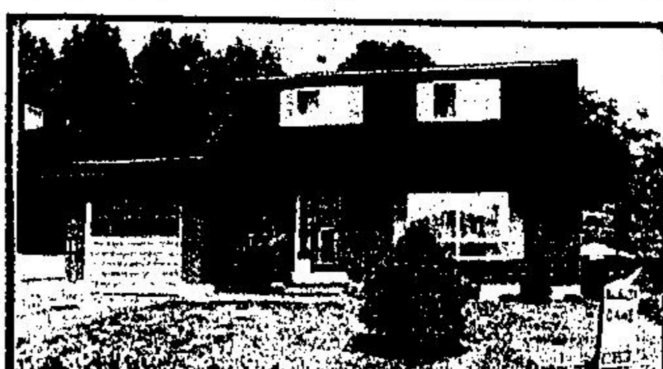
FOUR BEDROOMS. Better than NEW this home features, ceramic tiled floors, 2 washrooms, private yard, finished rec room and bar. Attached garage and paved drive. $74,900.00.