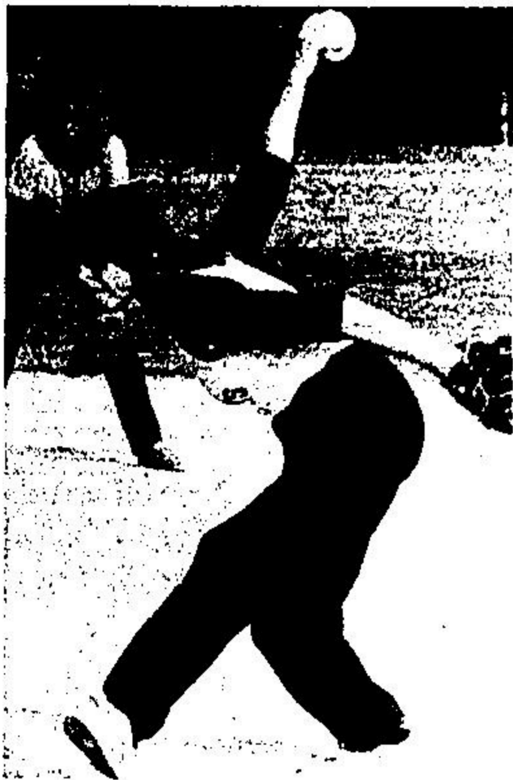
Here, a pitcher for the Burgundy Brewers shows her stuff in ladies powderpuff baseball at Fairgrounds Park.