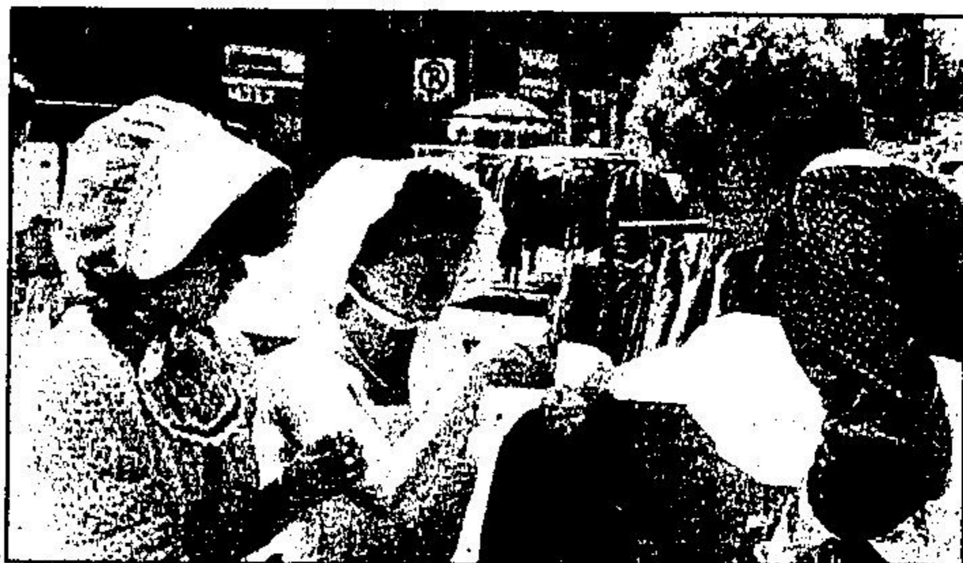
Sidewalk values always an attraction.