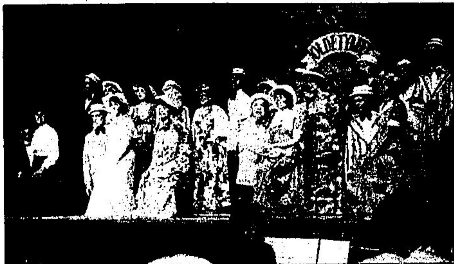
Nothing like an old tyme concert.