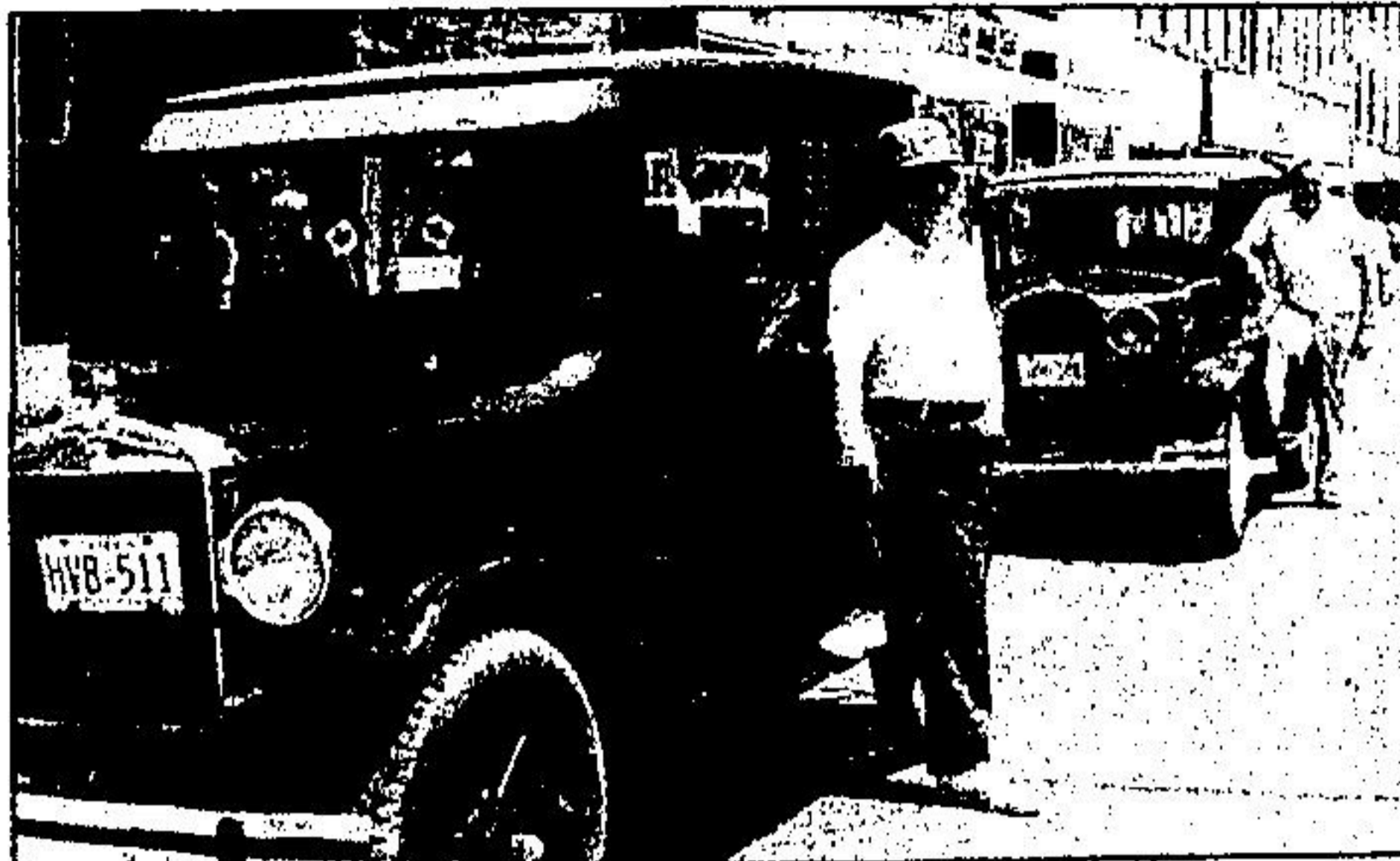
Vintage cars such as these are a feature of Pioneer Days.