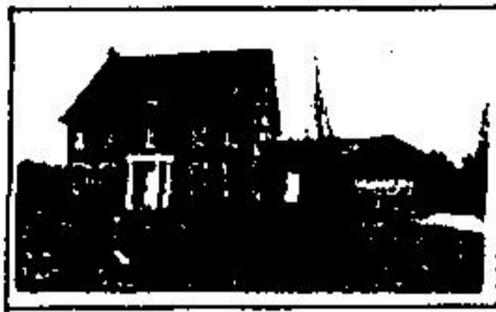
SOLAR HEAT on 26 plus acres. Executive type home with 3 bedrooms and 3 baths. Built in oven and stove and a roughed in fireplace in the master bedroom. Call Mal Dodge at 877-5213. A326