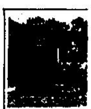
EXECUTIVE RANCH acres. 4 bedrooms, 3 1/2 Quality built home over. Too many features to Call Mal Dodge at 877-5213.