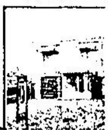
THIS FRESHLY DEC large professional lands spacious bedrooms, 3 b room. Walkout to a lot pool. Listed at $2,500. 877-5213.