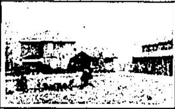
FALL IN LOVE with this farm boasting 49 of the most picturesque acres. This lovely old, 2 story, 5 bedroom home has a fantastic family room/kitchen combination. Priced at $174,900. Call Heather Whiting at 877-5213. A311