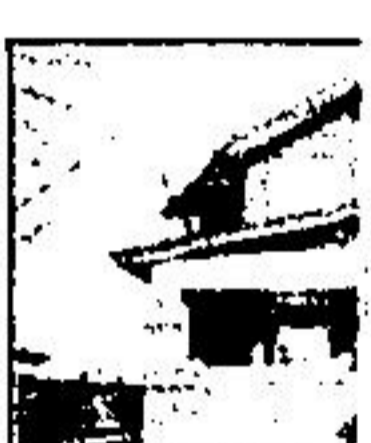
GRACIOUS OLD HC original oak trim, front room and fireplace in $78,900. Call Norinne K. 877-5213.