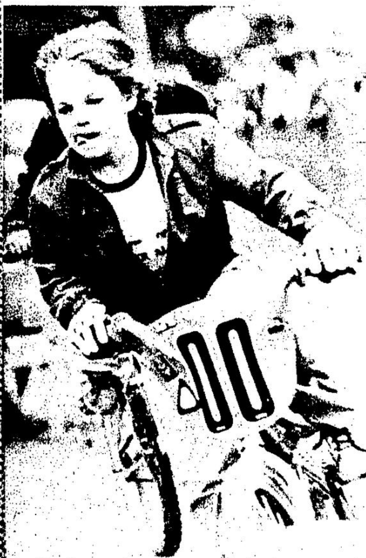
When BMX races weren't underway, kids could try their hand at the specially-designed course. Races began in the morning and concluded in the afternoon with a finale.