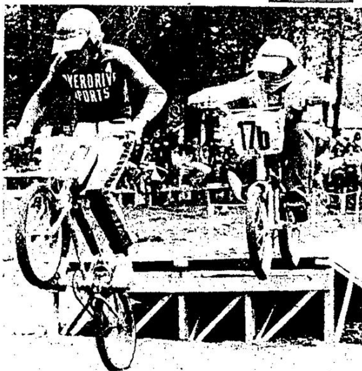
New to Bang-O-Rama this year, BMX races proved to be one of the event's most popular attractions. Kids on specially constructed pedal bikes ran a small course full of hair-pin turns and jumps in a race not unlike moto-cross.