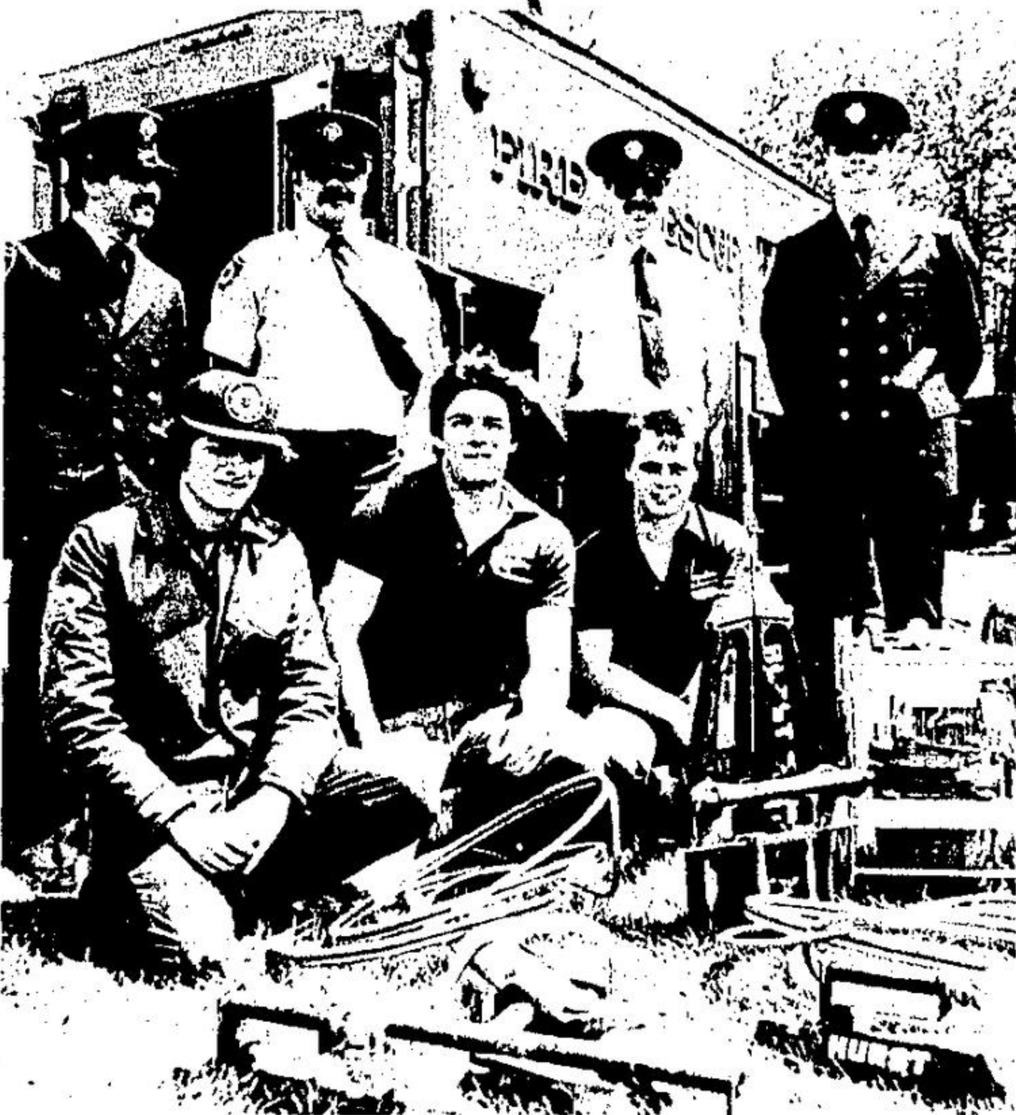
Members of the Georgetown brigade of the Halton Hills fire department were at Bang-O-Rama Monday with displays of their equipment and sound advice on fire prevention. Pictured here with the town's jaws of life rescue equipment are (front row,