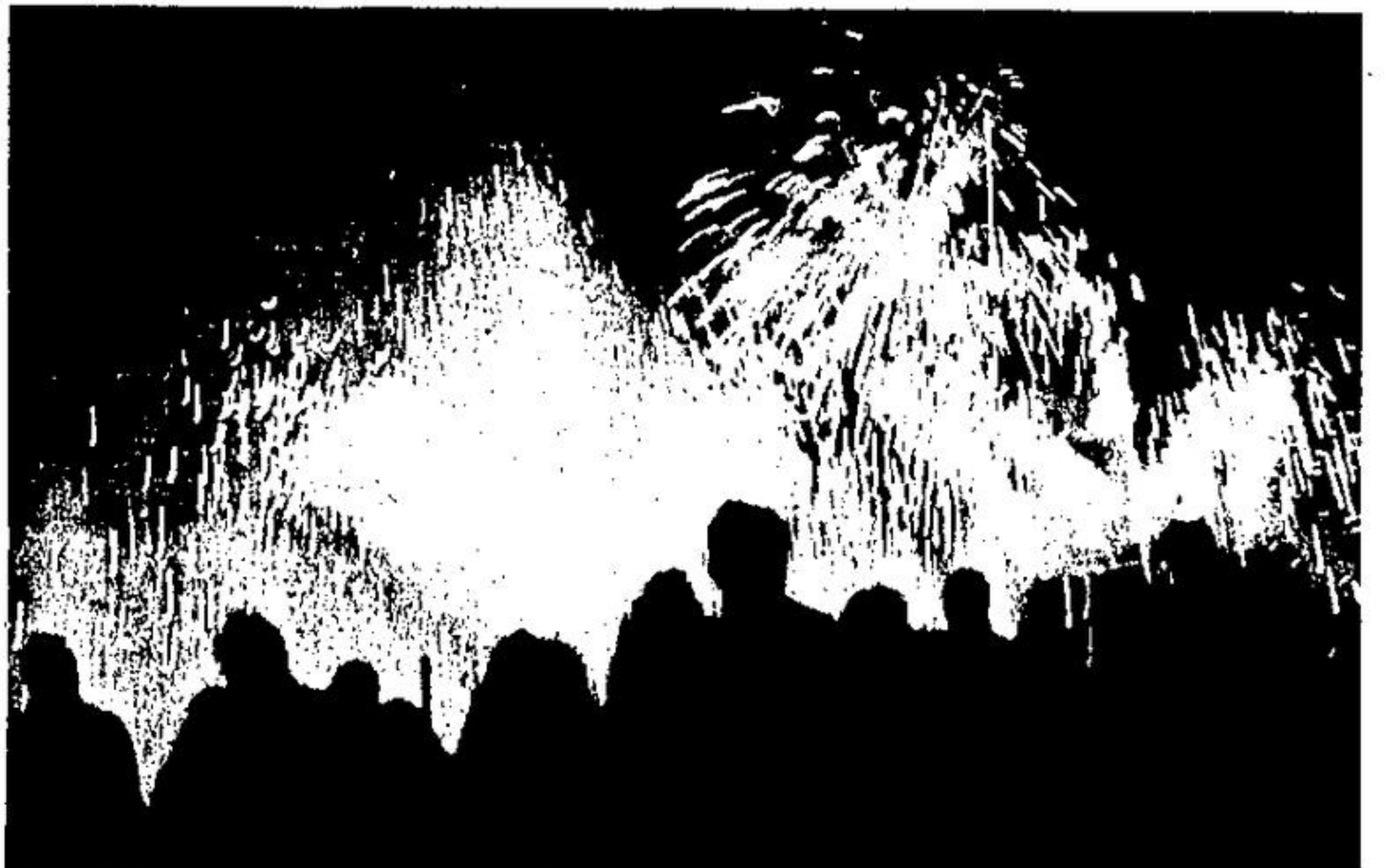
As darkness fell over Georgetown's Fairgrounds Park, local Optimists began lighting their elaborate fireworks display. Hundreds turned out to see the show and this time, the weather was just perfect. As well as an aerial display with rockets,