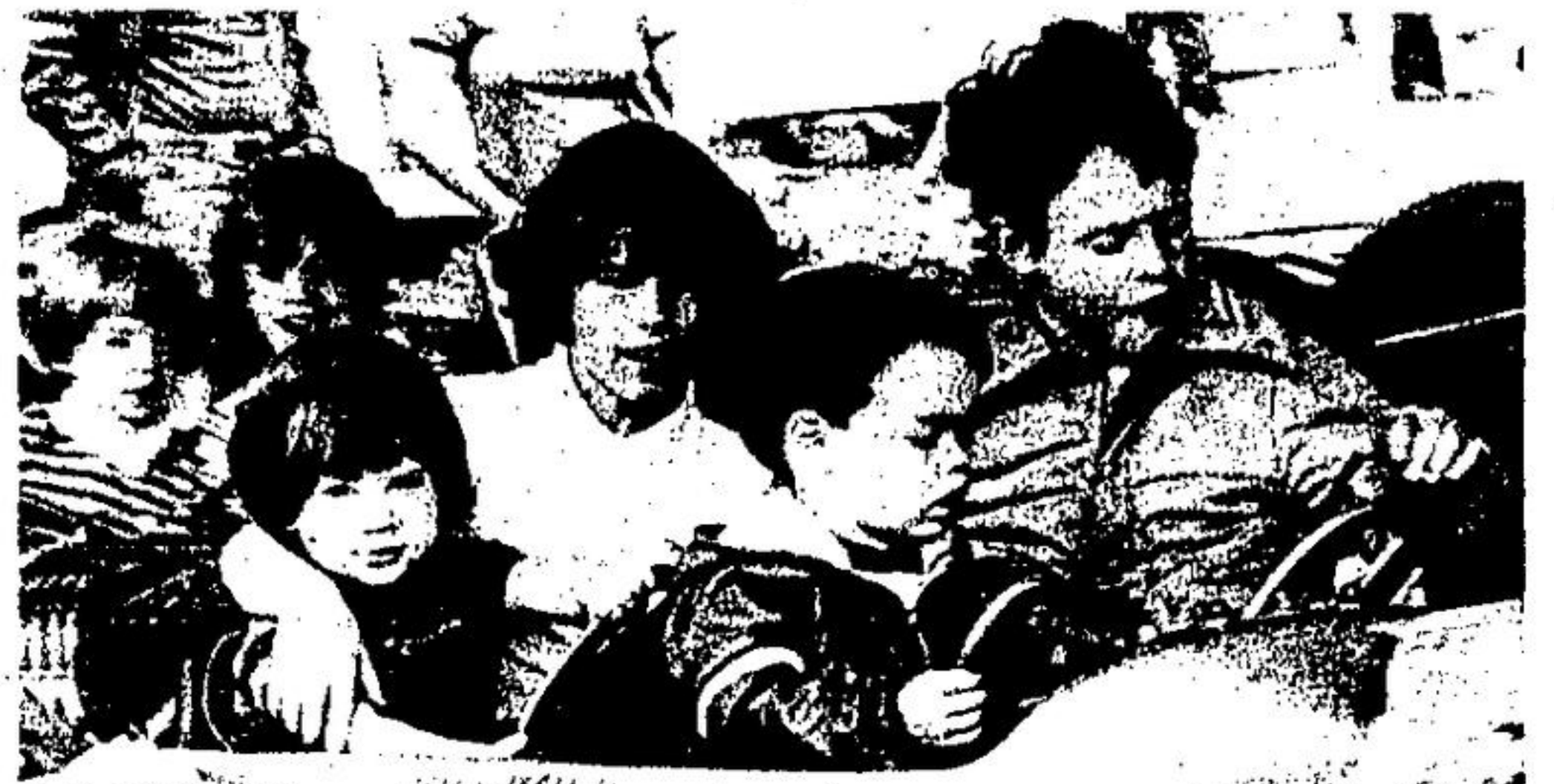
This group of youngsters seems to be enjoying themselves on one of the rides set up at the Bang-O-Rama midway.