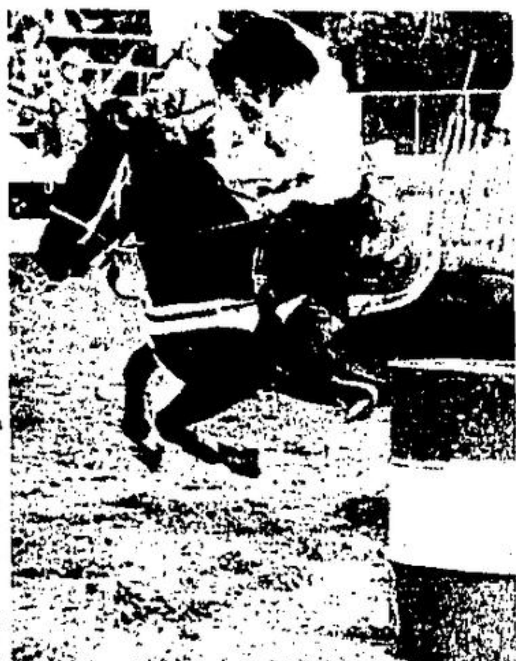
One of the more popular horse events at Bang-O-Rama Saturday was the barrel race. Riders combine in-saddle dexterity with speed as they wheel around barrels positioned along a short course. For tamer stuff, Norway's ZRC Ranch had hay rides, the proceeds from which were donated to the Georgetown Optimists Club's fund-raising drive to get a special lift for handicapped students at Georgetown and District High School.