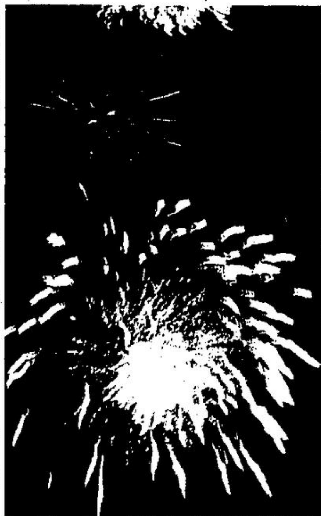
The aerial fireworks display was spectacular. Against a cloudy backdrop, the rockets exploded brilliantly, delighting the audience below.