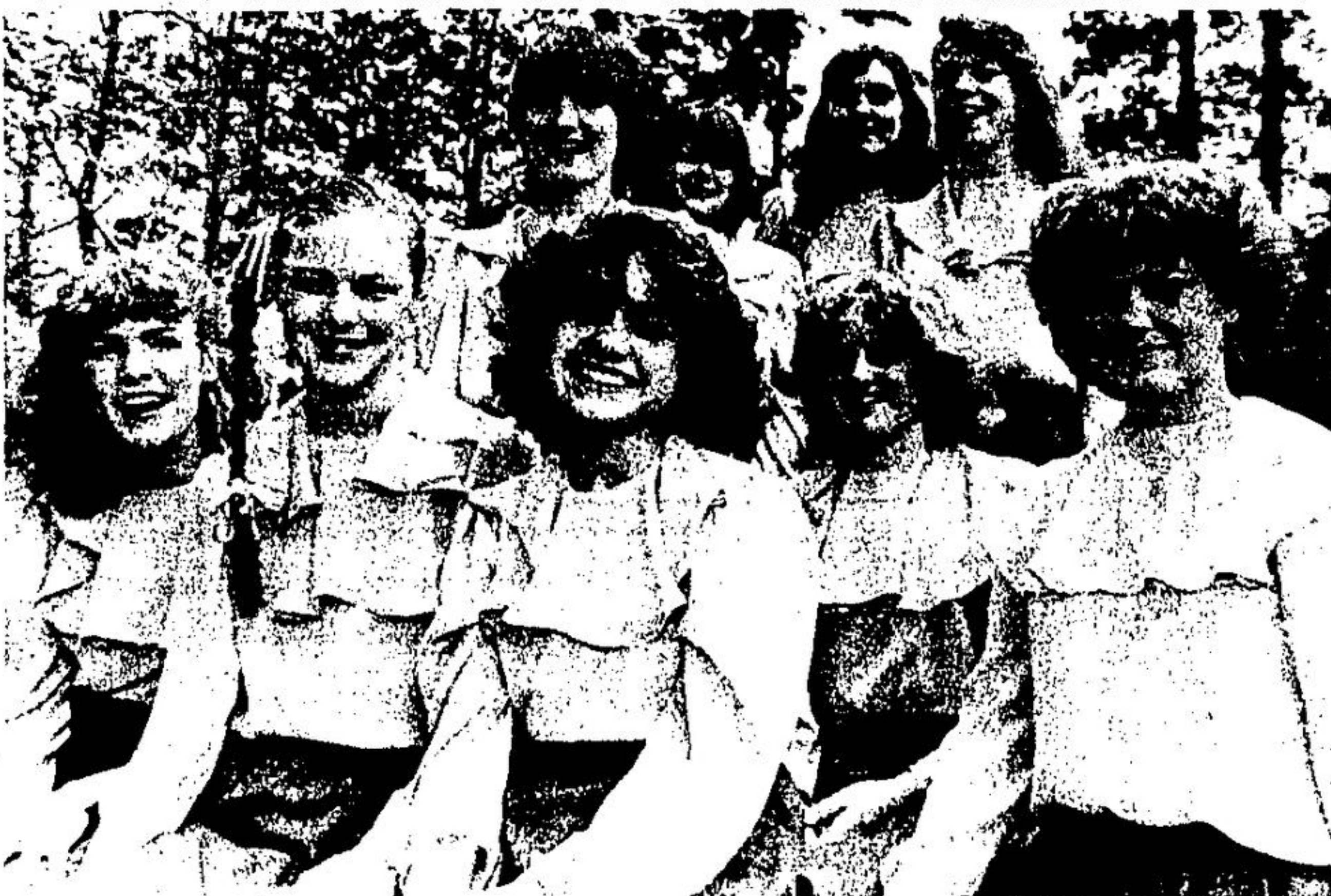
PURE GOLD IN CANTANTE 'RAINBOW'

Brothers, Al-Anon, Alcoholics Anonymous, Al-A-Teen, Meals-On-Wheels, Red Cross after hours, Toughlove, and the Widows Self-Help Group.