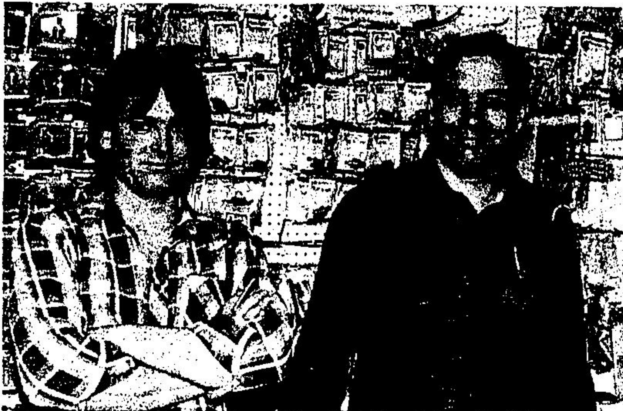
The Plumbing Store at 330 Guelph St. is backed by his 23 years of experience in the plumbing business.

A thorough examination of your roof will help you decide whether it is ready for retirement or simply in need of minor repairs.