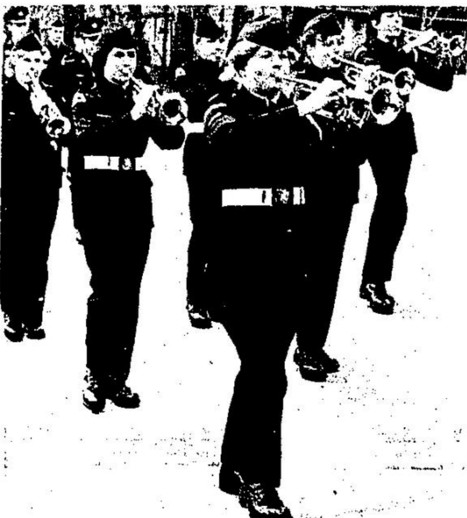
Air Cadets squadron 756 started their parade at 10:30 a.m. Sunday, marching from Georgetown's Cedarvale park downtown to Knox Presbyterian Church on Main Street. There were 65 out of 75 squadron members present for the chilly walk across town.