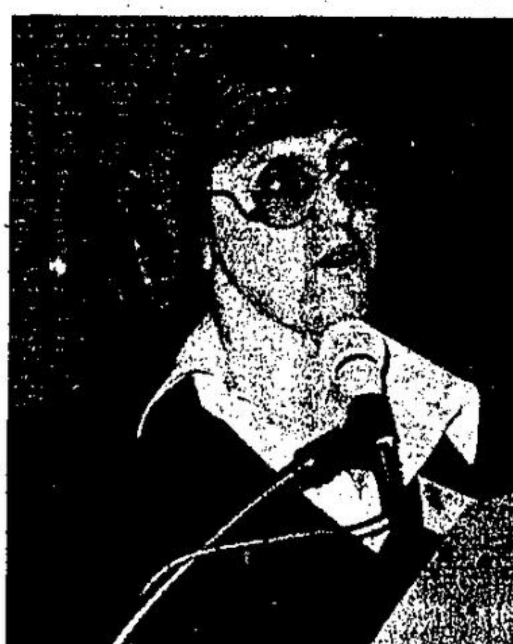
Speaking of awards, Cindy Nicholas, pictured here, has won a few. A former Canadian Woman Athlete-of-the-Year and member of the British Hall of Fame, she has also been named to the Order of Canada for her 19 crossings of the English Channel.