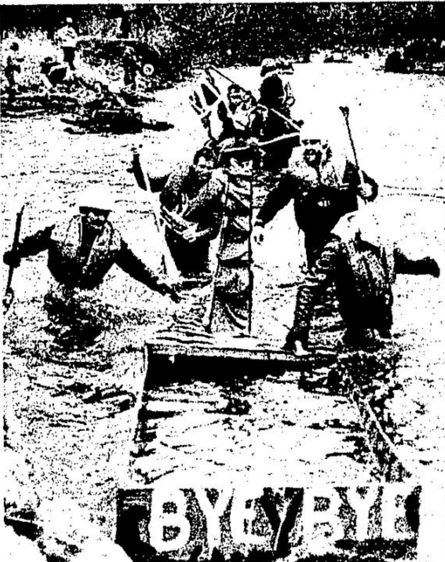
In the bottom photo a landlubber awaits the starter's gun to announce the Crazy Boat start. In the top photo, four members of a crew abandon ship close to the finish line.