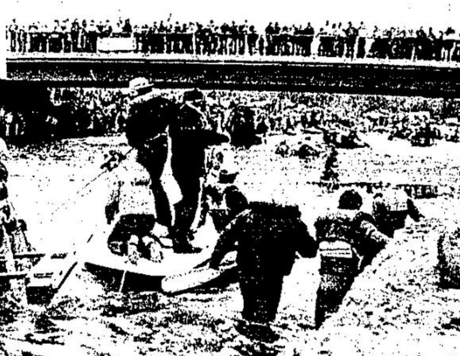
At the Glen Williams bridge spectators lined up in steady swarms as the Crazy Boats floated into the finish. Some craft made it to the bridge without their crew snuggled safely inside. The durability of each craft was severely tested in a number of shallow areas and rapids.