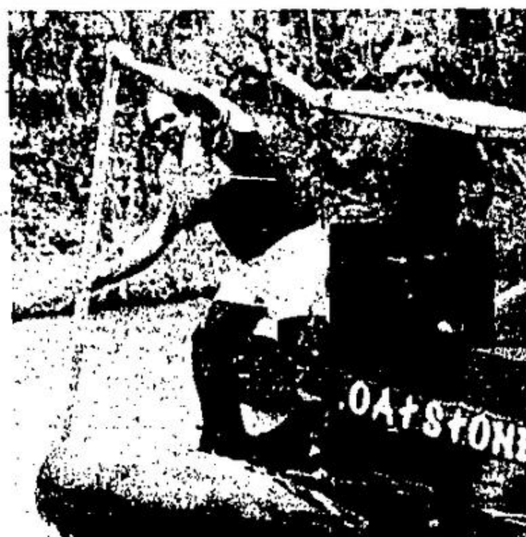
The Floatstone craft proved seaworthy enough in the Crazy Boat race, completing the course almost in one piece.