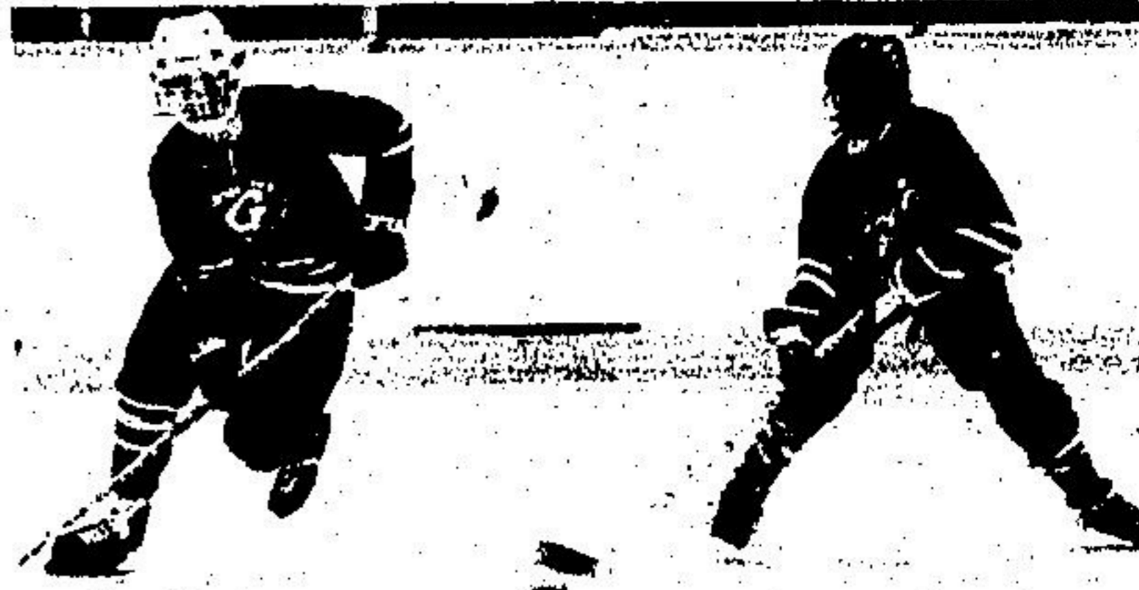
The Major Midget Reps from Georgetown (seen above) were runner-ups in the local Midget tourney last week, drawing crowds as large as 600 at the Gordon Alcott arena.

Having confidence in your equipment brings greater confidence in your skiing.