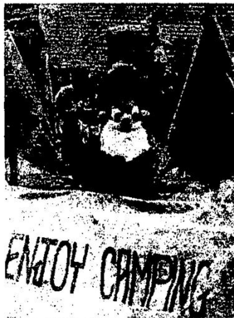
Garfield the famous cat and his dwarf friends endured the drizzle quite nobly on the float prepared by the Georgetown Fireflies Association. This was Garfield's first year on the trail and he's promised to make a come-back next year, rain or sun.