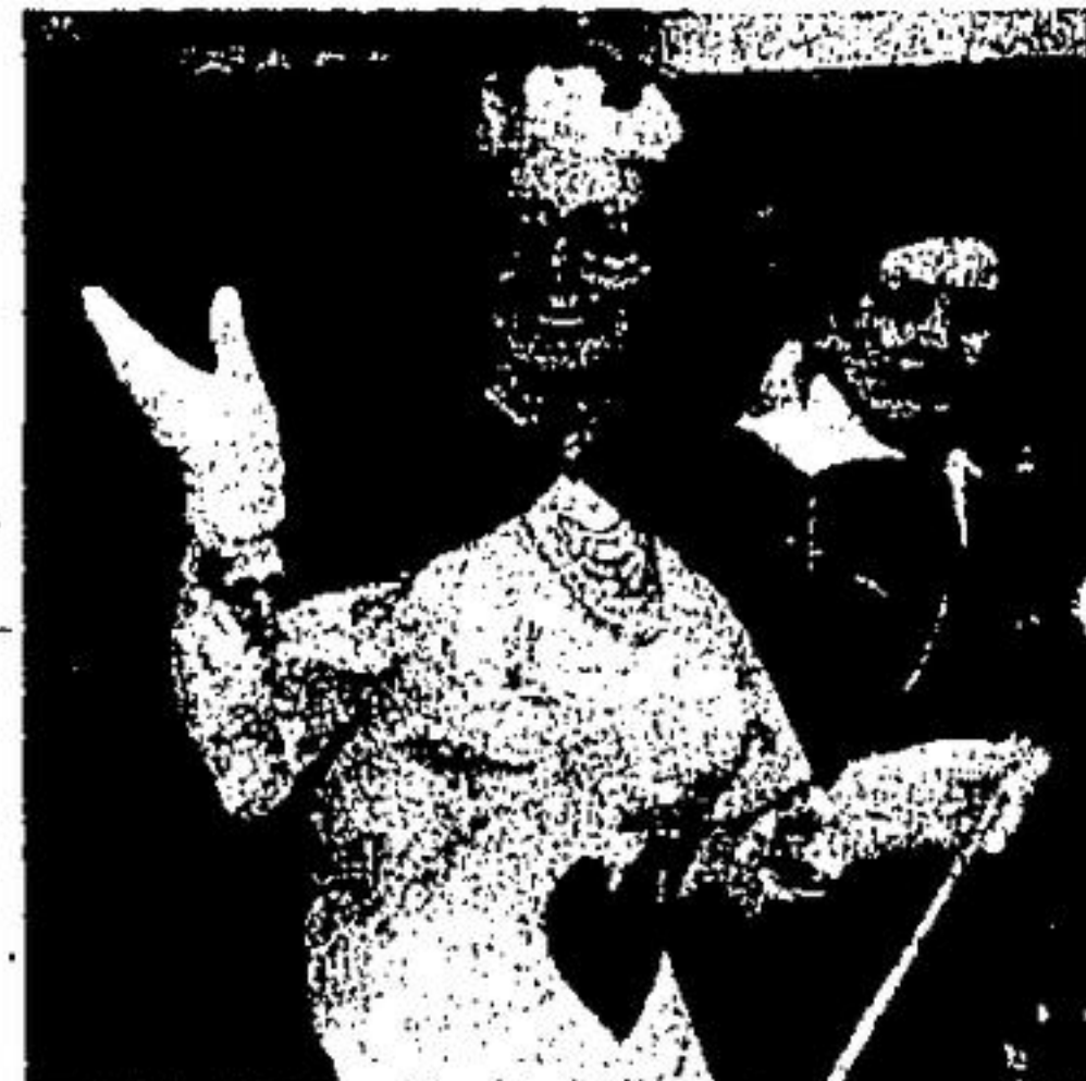
Wanna make a deal, sweetheart? Hearts, I'm yours. The Queen of Hearts spread the good cheer, wand in hand, among the hundreds of youngsters and adults along the Georgetown parade route.