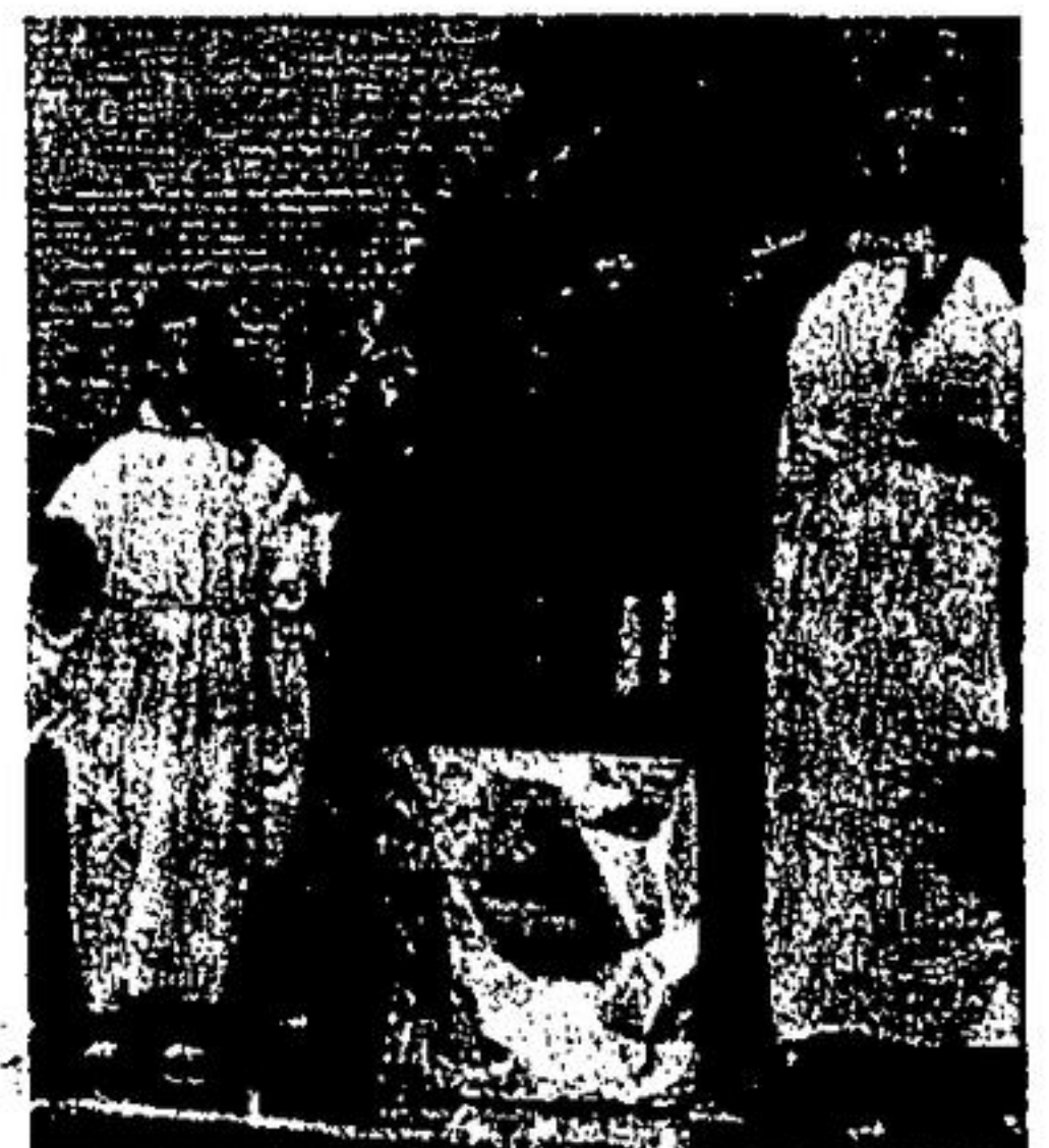
Mysterious packages gave hints of things to come, on this float. A large number of groups entered floats this year and prizes were awarded, as in the past, to the most original float, the best commercial float, the best overall, the best theme and the best service club entry.