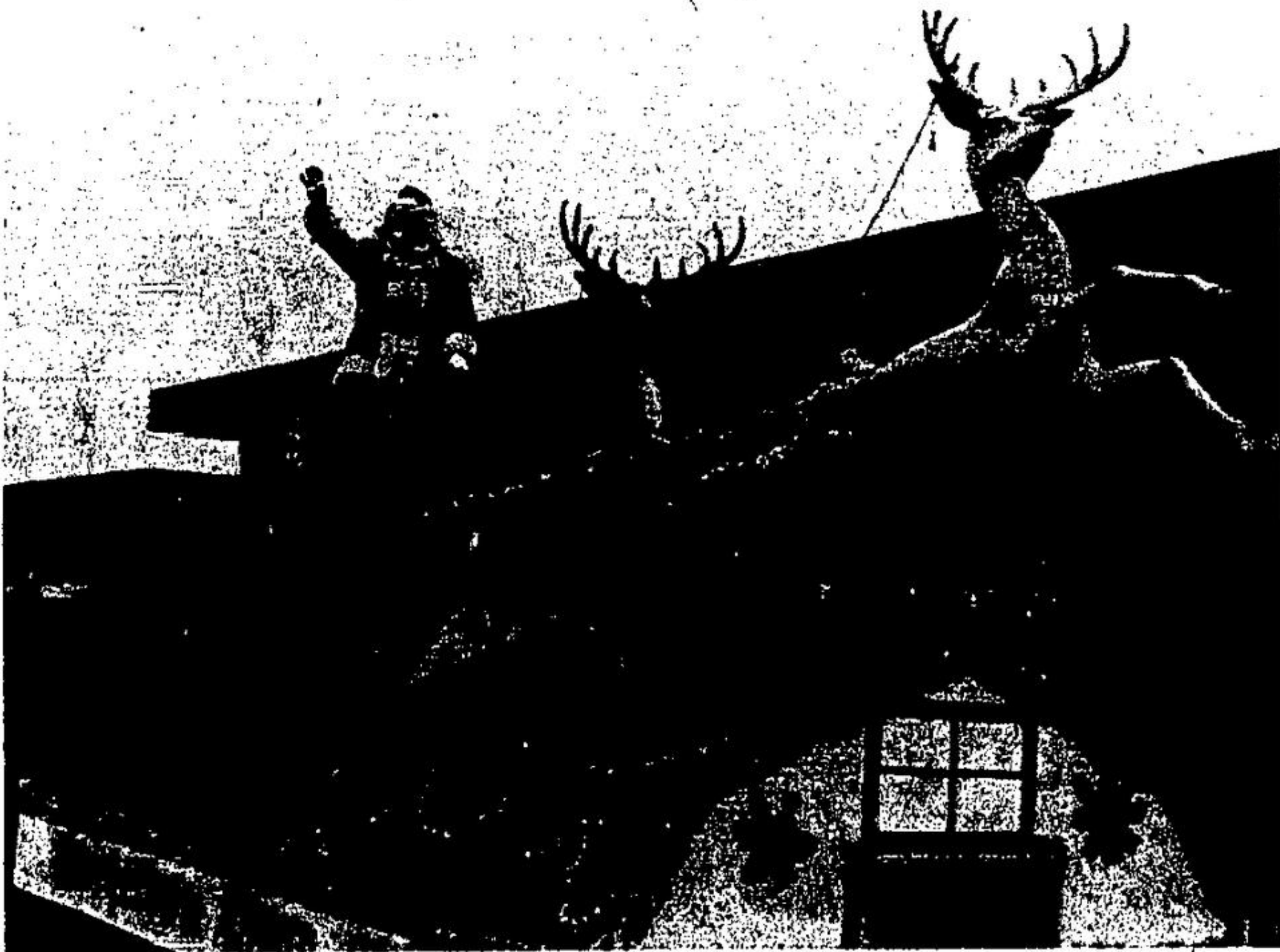
Merry as ever, the dear old man from the North Pole made it down for the 1:30 afternoon start of the Georgetown parade Saturday. The key guest in the annual event has been coming down for 52 years now, never missing a parade and always jolly no matter the weather. This year Santa Claus got a kick out of the Georgetown event, when his