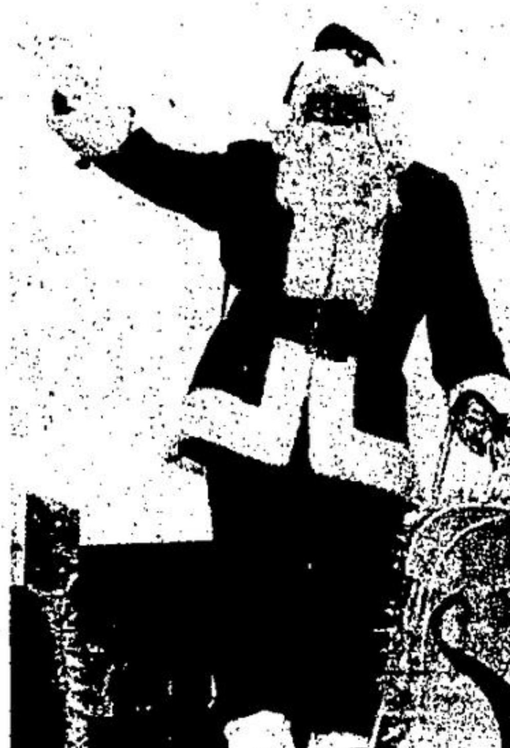
This year's parade route began at the Georgetown Market Place. From there, marchers and floats proceeded down Guelph Street west to Maple Avenue. Halton regional police were out blocking roads in advance of the parade. From Maple Avenue, the event