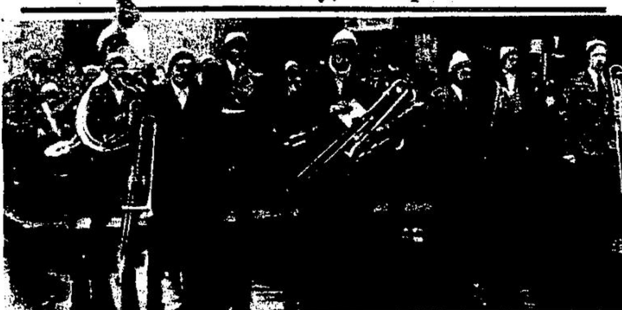
The Acton Citizen Band trumpeted clear a path for following floats. Their bright red uniforms added

Don't forget! Acton Y's Men's SANTA CLAUS PARADE This Saturday, 1:30 p.m.