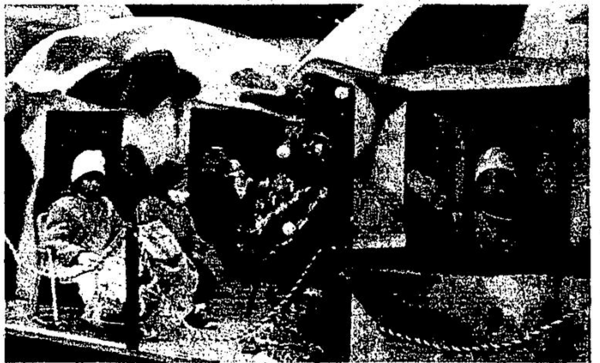
Umbrellas and rain jackets were a necessity for spectators out to catch a glimpse of Santa and hear the marching bands. The dismal gray day didn't dampen spirits, nevertheless. There was an expectant excited air among the collected crowds at the Georgetown Market Place and Main Street downtown area. Fire and