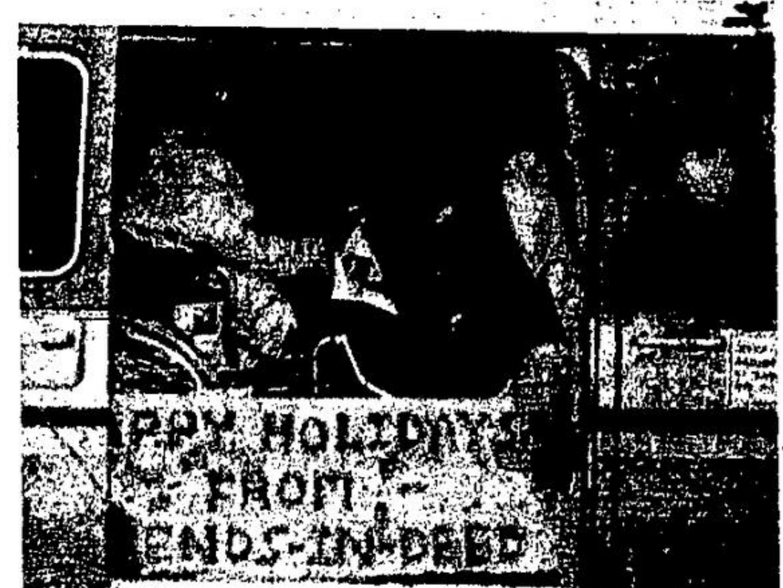
Trucks along with the rest of the parade were members of the Acton based Friends-IN-Deed group, their dogs and children. The friendly and well packed van got lots of waves returned from well-wishers along the route.