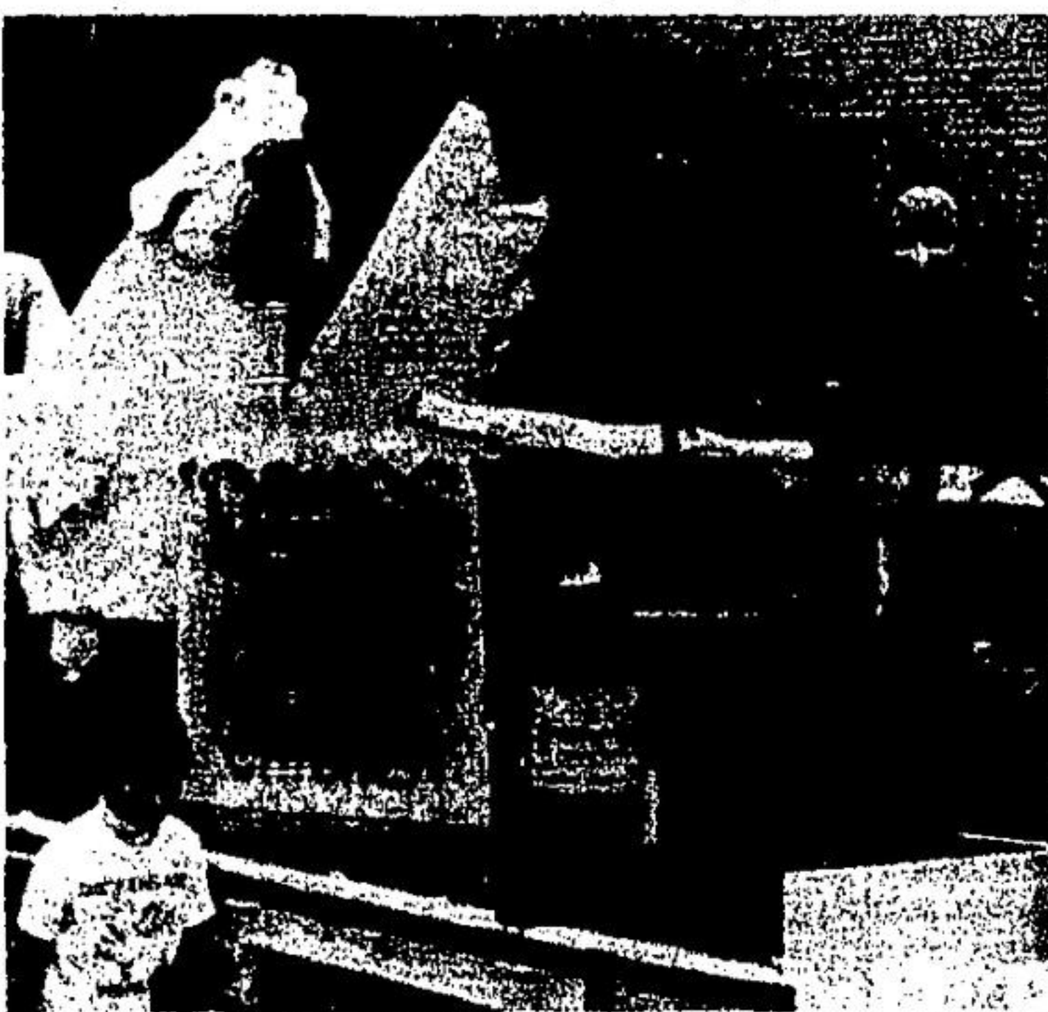
Without a squawk, the Optimists Chicken let himself be led along the parade route Saturday, accompanied by his Chicken Club pals. The Chicken Club is promoted by the Optimists service club to discourage children from experimenting with harmful drugs. It says it's all right to say "no" to the drug scene.