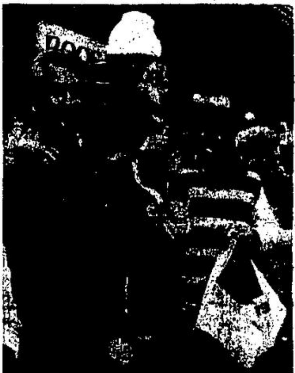
Lollipops for little girls, from a nice bee carrying a bag of sweets. Daddy's shoulder sometimes got a little sore and fire hydrants did the trick. Hundreds of Georgetown children turned up for the Lions Club Santa Claus parade. Besides special guest Santa were many old favorites like the Acton and Georgetown fire brigades, the Acton