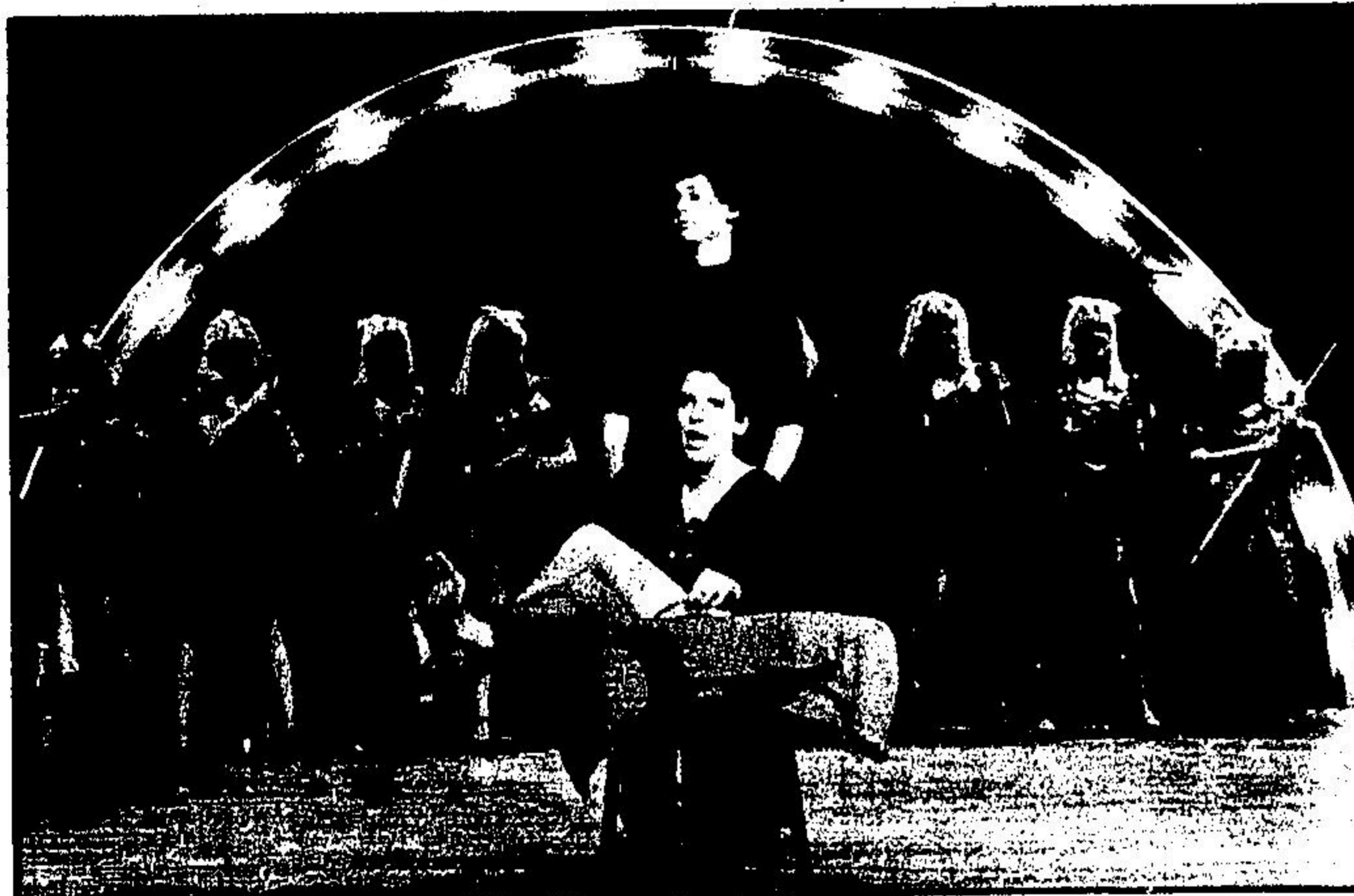
TONIGHT'S THE NIGHT