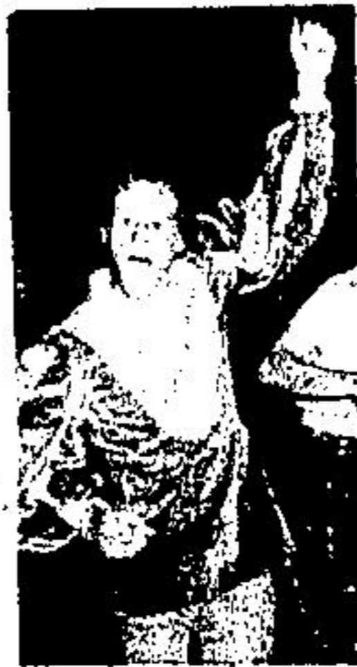
At the South Pole the ice is about 3,000-meters or almost two-miles thick. The deepest ice, just discovered, is 4,700-meters thick.