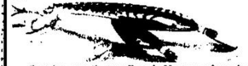
Seen here are the new Rapala Magnum lures in size 11 and 14 made by Normark Corp.

The North Bay Fish Hatchery is tagging 200,000