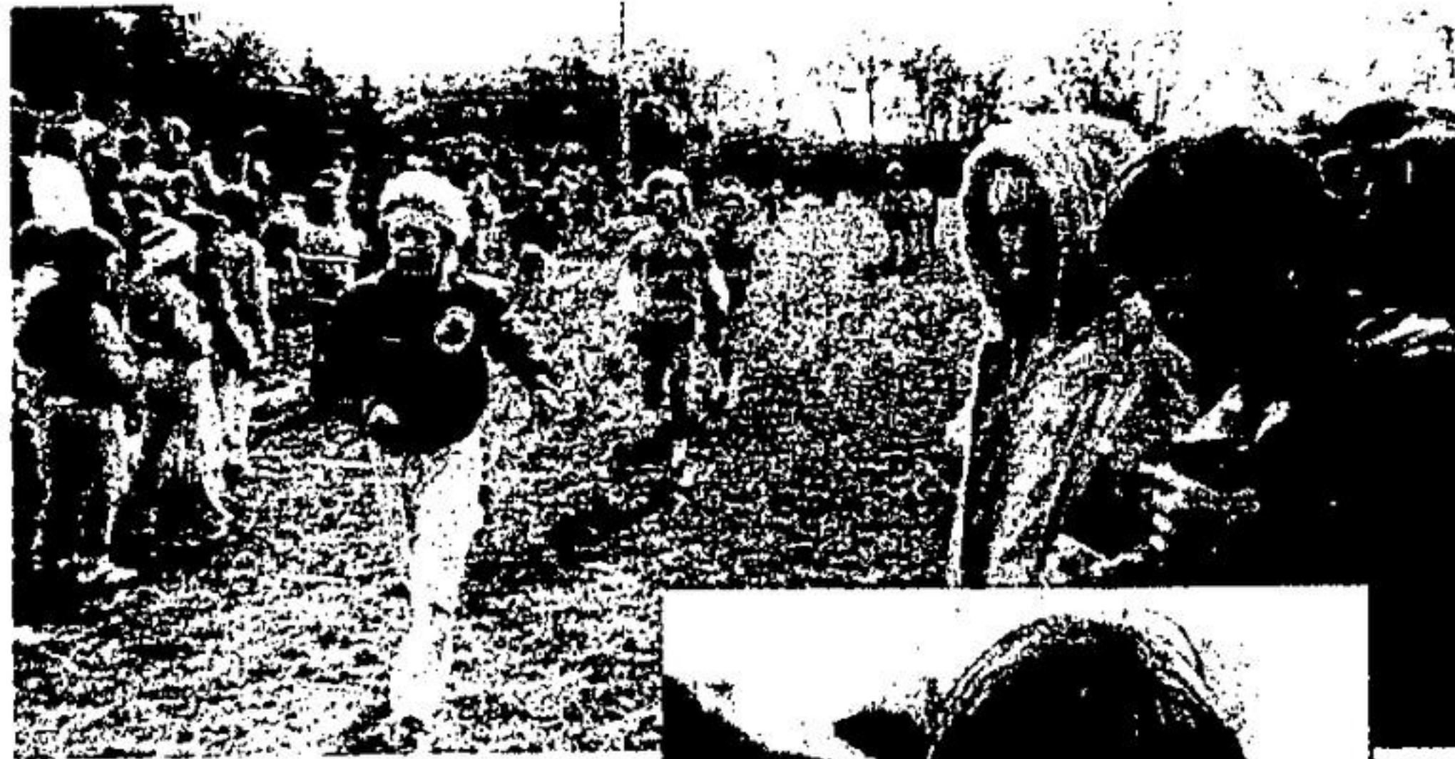
The finish to the Optimist cross country invitational was an exciting place to be Saturday.