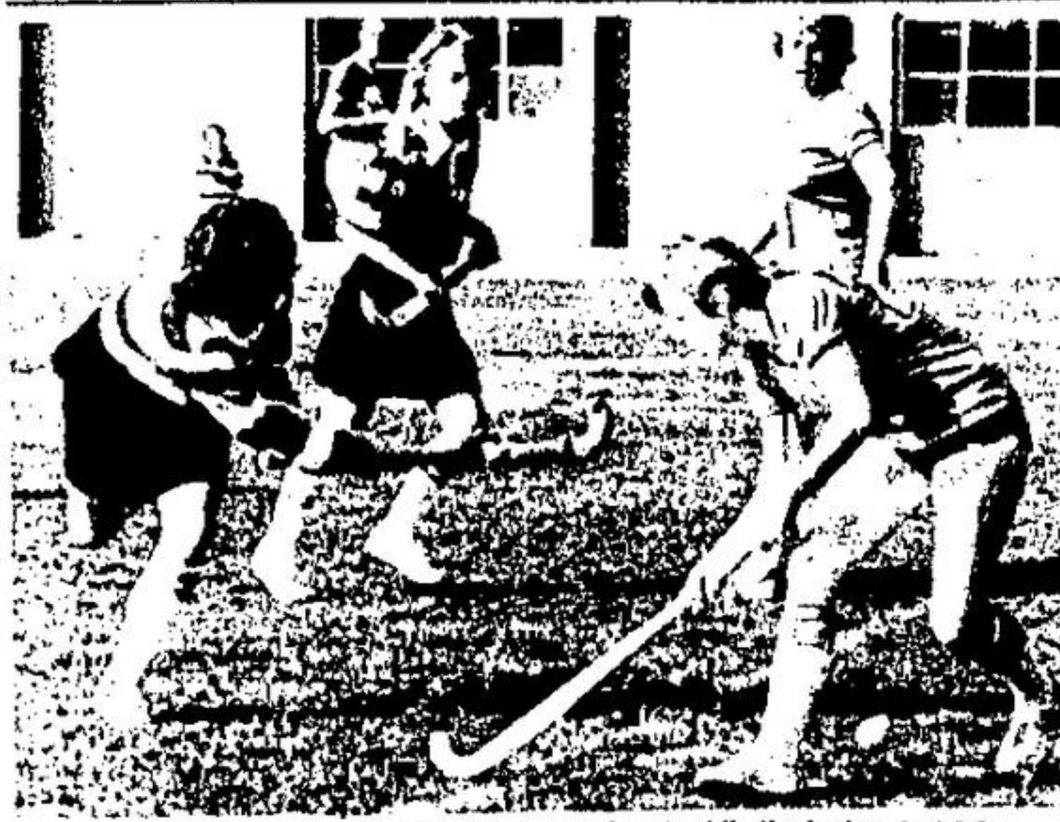
The GDHS senior girls blanked Lord Elgin 1-0 while the juniors lost 1-0.