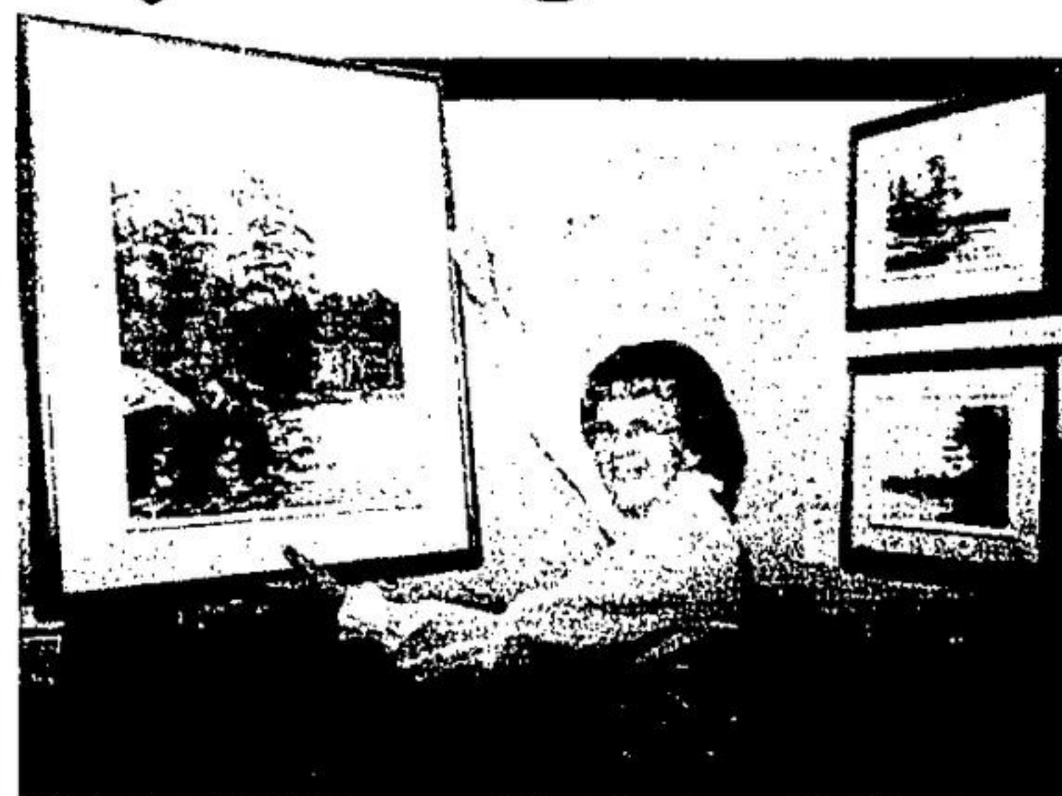
HER MUSKOKA MEMORIES

Plans for the 1983 season are well underway, and if the experience of our first year of operation is any guide, Halton Hills residents will continue to enjoy an eclectic collection of events.