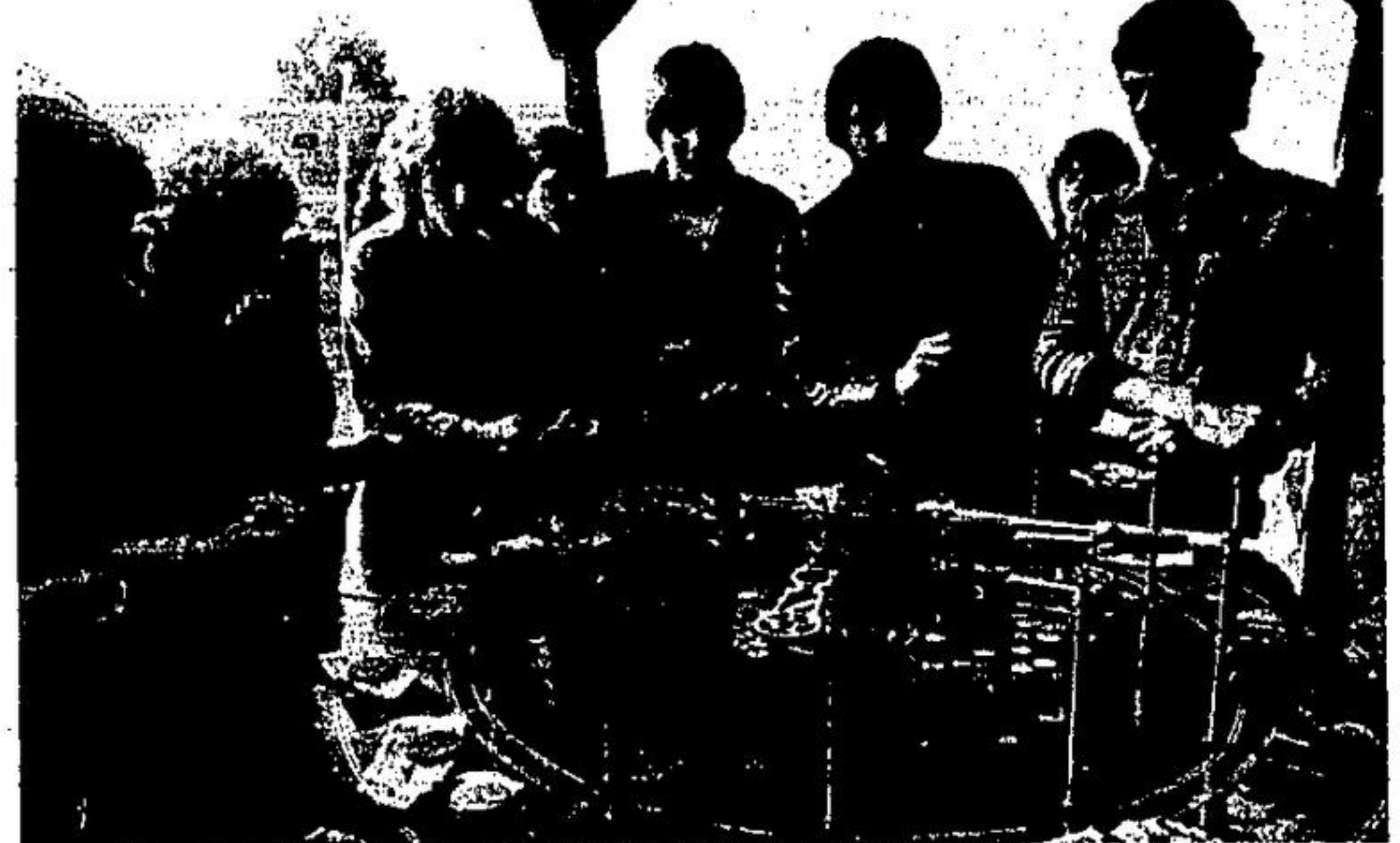
Few things draw a crowd quicker than a game of chance and throngs of people milled around the arcade-amusement area at the Acton Fall Fair this weekend. The three-day event held in Acton's Prospect Park was blessed with good weather and attendance figures soared.