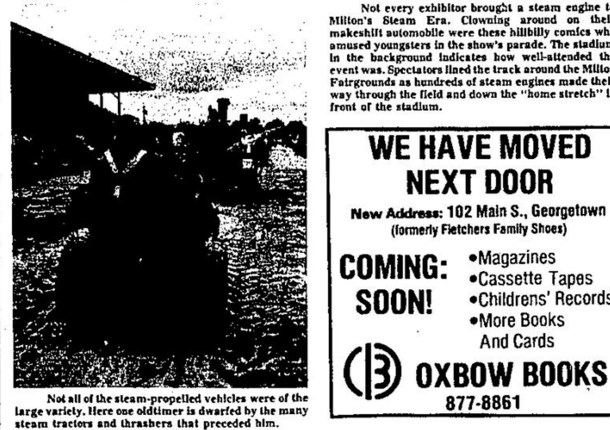
Not all of the steam-propelled vehicles were of the large variety. Here one oldtimer is dwarfed by the many steam tractors and thrashers that preceded him.