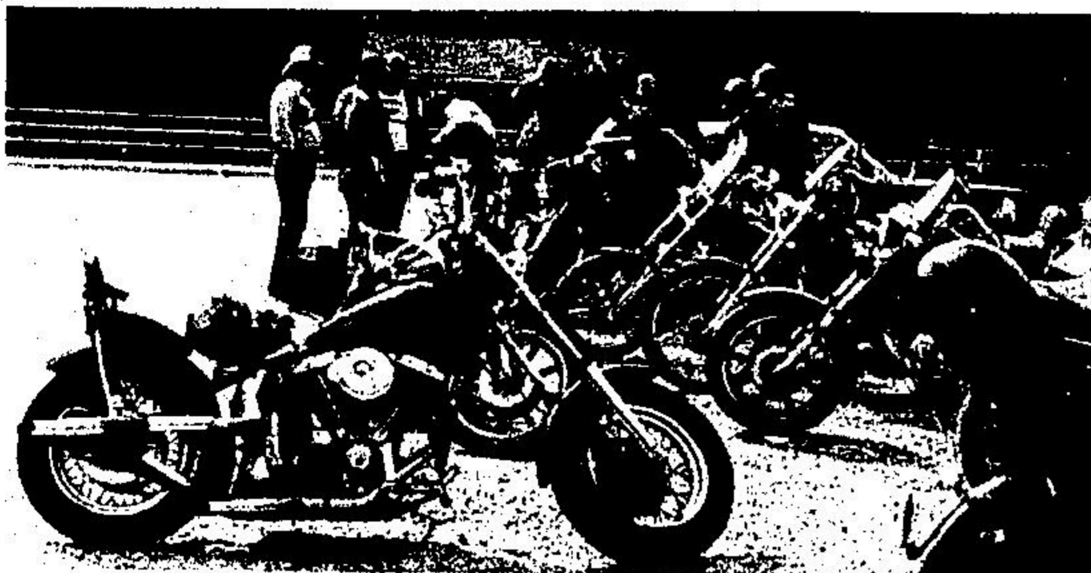
About 20 tough looking men converged on the Hollywood Tavern in Norval. Members of the Vagabonds bikers from Toronto, the men were down as extras for the "Terry" film, shooting a scene in which Terry Fox had a wad of bills thrown into his van by a group of Maritime bikers sympathetic to his cause. The bikers said they expected the movie to be very popular with the Canadian public.