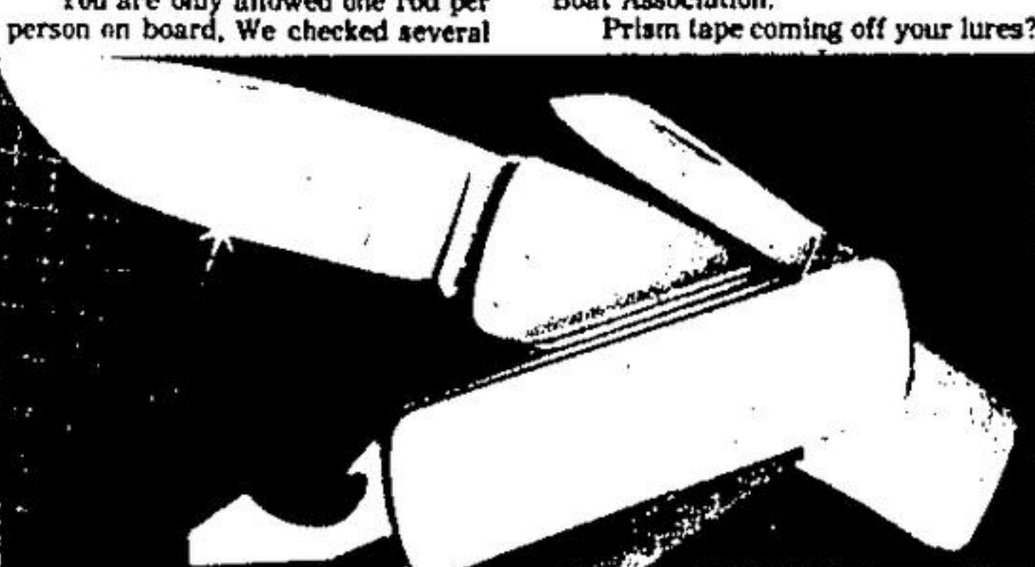
New Stainless Steel Knives by Normark.