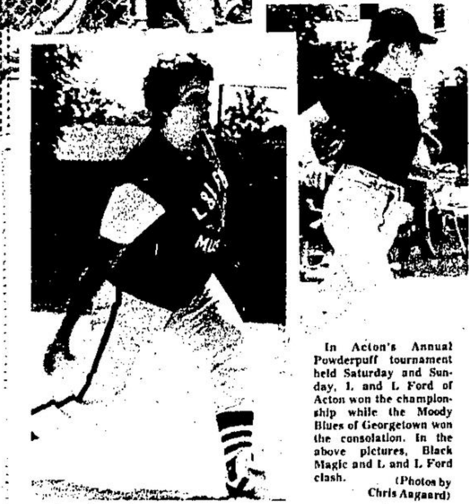
In Acton's Annual Powderpuff tournament held Saturday and Sunday, 1 and L. Ford of Acton won the championship while the Moody Blues of Georgetown won the consolation. In the above pictures, Black Magic and L. and L. Ford clash.