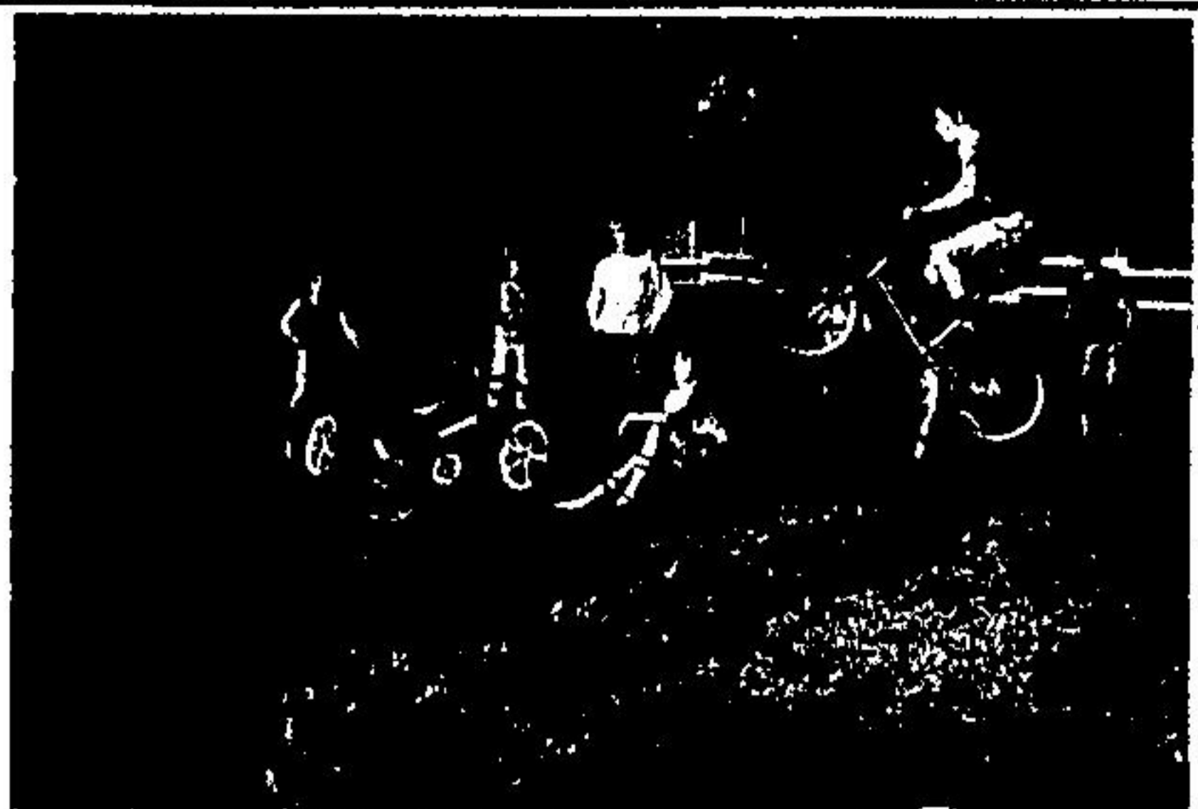
Rainpuddle fun, after the storm

Other check points include pool insurance, fencing, the existing zoning for pools, site location, local building regulations and restrictions, grading requirements.