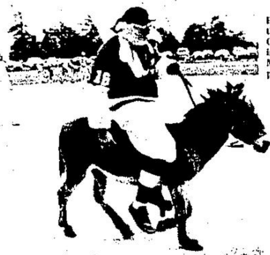
Supporting the Raiders in the venture

One particularly ornery white donkey threw everyone within throwing