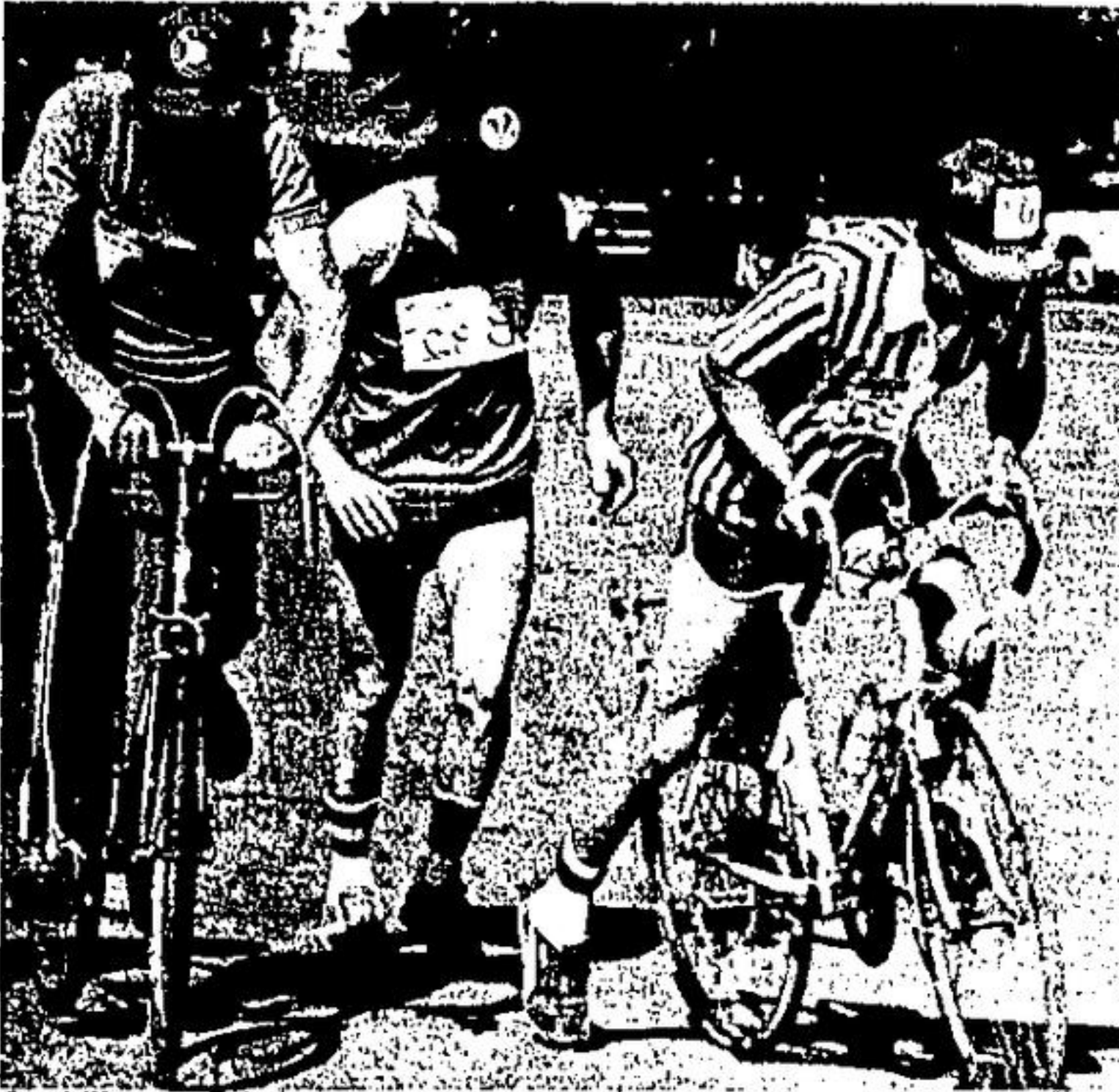
Biathlon racers last year starting off on their 10 kilometre trek: Acton Y's bicycle and running race promises to be lots of fun for participants who require an equally proficient partner to do well.