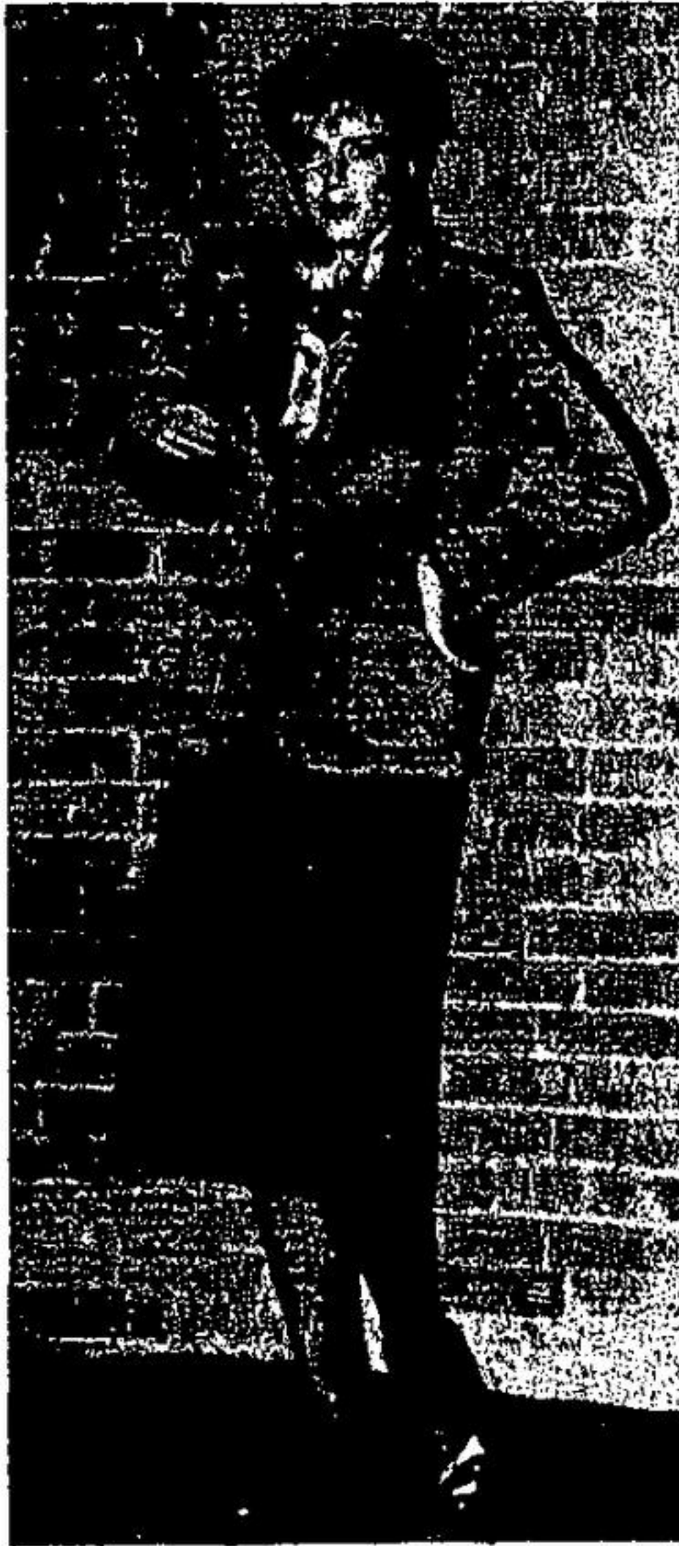
Management at the Old Hide House and Jack Tanner's Table restaurant welcomed members of the media to a special social evening last Wednesday night and later announced that the Acton establishment would be expanding. Just before a fashion show, held to parade some of the latest items in leather the Hide House is carrying, plans were unveiled for a 10,000-square foot "Artisans' Village", allowing craftsmen to practise their trades right before the eyes of an admiring public. The village would also have a bakery, country store, delicatessen and plenty of space for crafts displays in sheltered, but spacious surroundings.

The interior of the village will closely resemble the decor of the retail outlet and the adjacent Jack Tanner's Table restaurant, emphasizing the building's rustic brick and soft, natural lighting. Mr. Dawkins added that most of the work in the section will be repairing and insulating the roof, as well as cleaning up from the furniture operation. The dividing wall between the retail store and the "village" will be opened up at the ceiling and the floor plan will be "as wide open as we can get it" while still maintaining security for the individual artisans and shopkeepers.