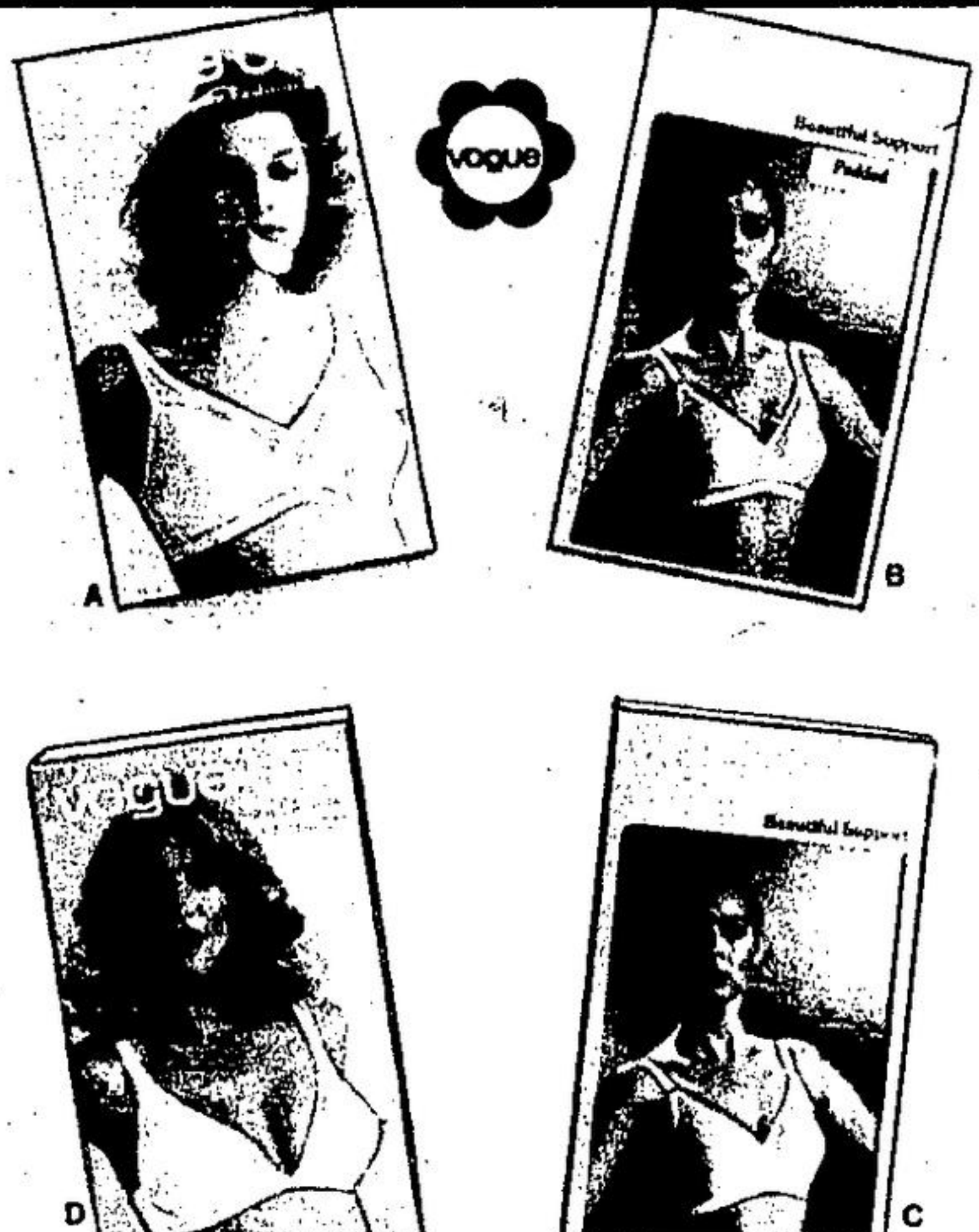
Figure-Flattering "Vogue" Bras

Smooth nylon cups, nylon/spandex back and sides. Machine-washable. White or beige.