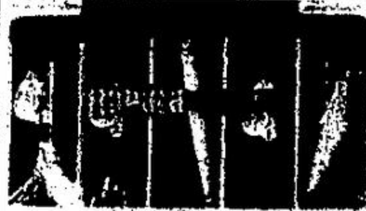
This is what the new trophy kits by Normark look like: a good idea for a Father's Day gift.

Belfountain is also stocked if you fish there. The long weekend was a "wash-out" for many fishermen, although there were sunny periods in the traditional north country. Yet there