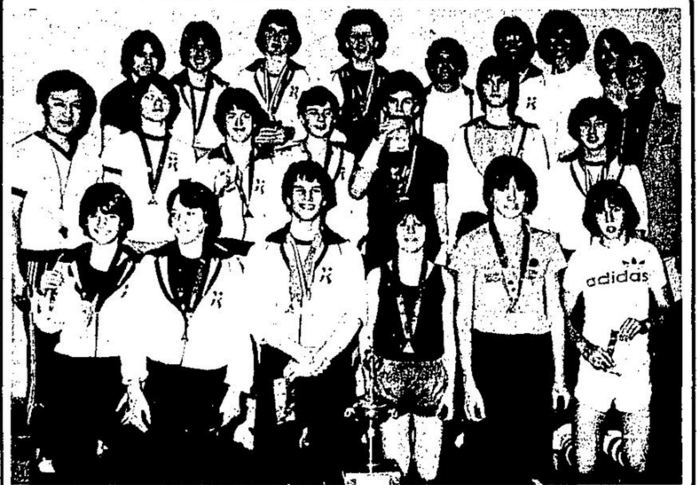
The Georgetown District High School gymnastic boys team distinguished themselves at provincial (OFSAA) competition two weeks ago. The seniors placed third and the junior team were fourth.