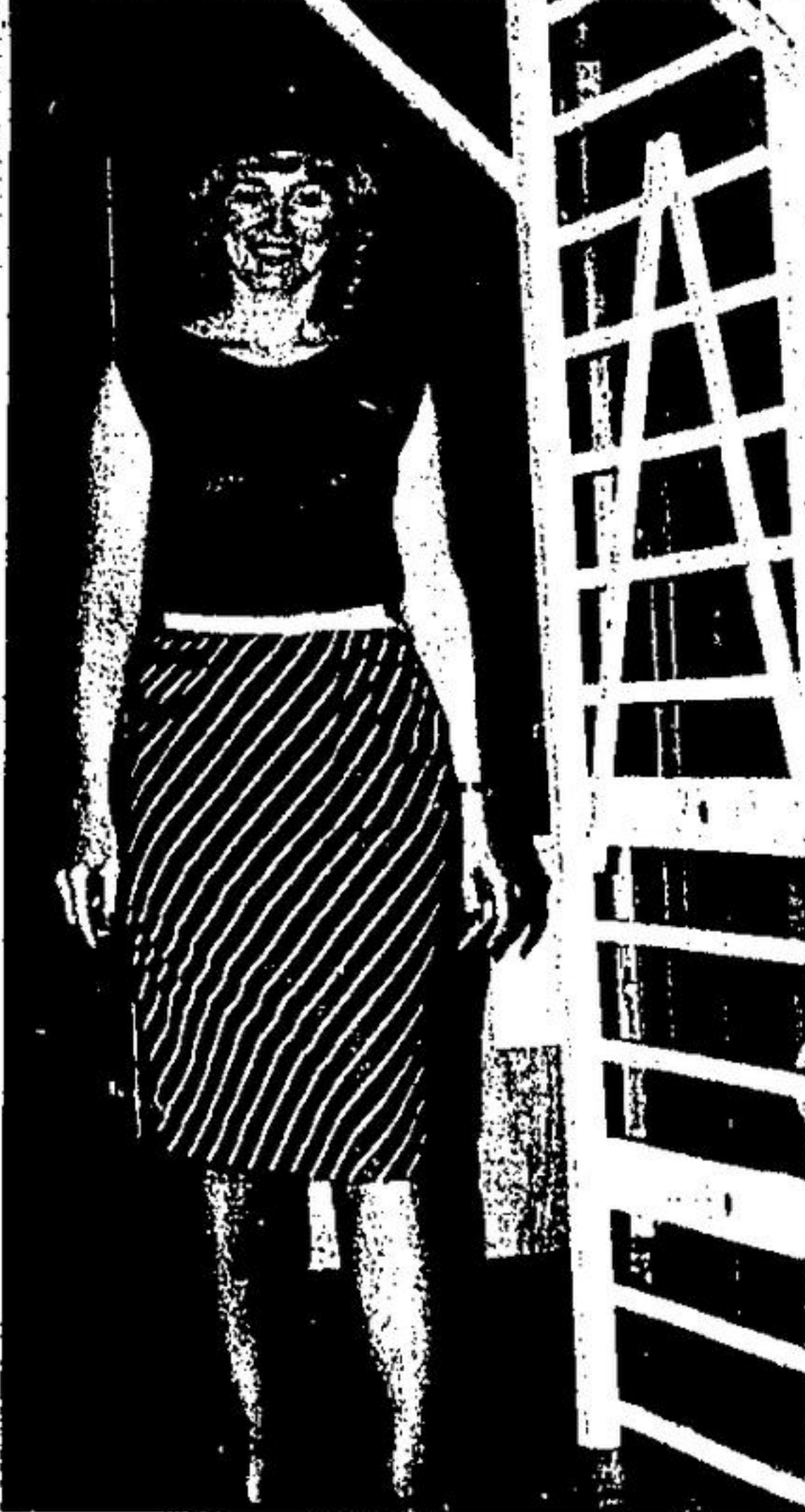
WALKING IN STYLE