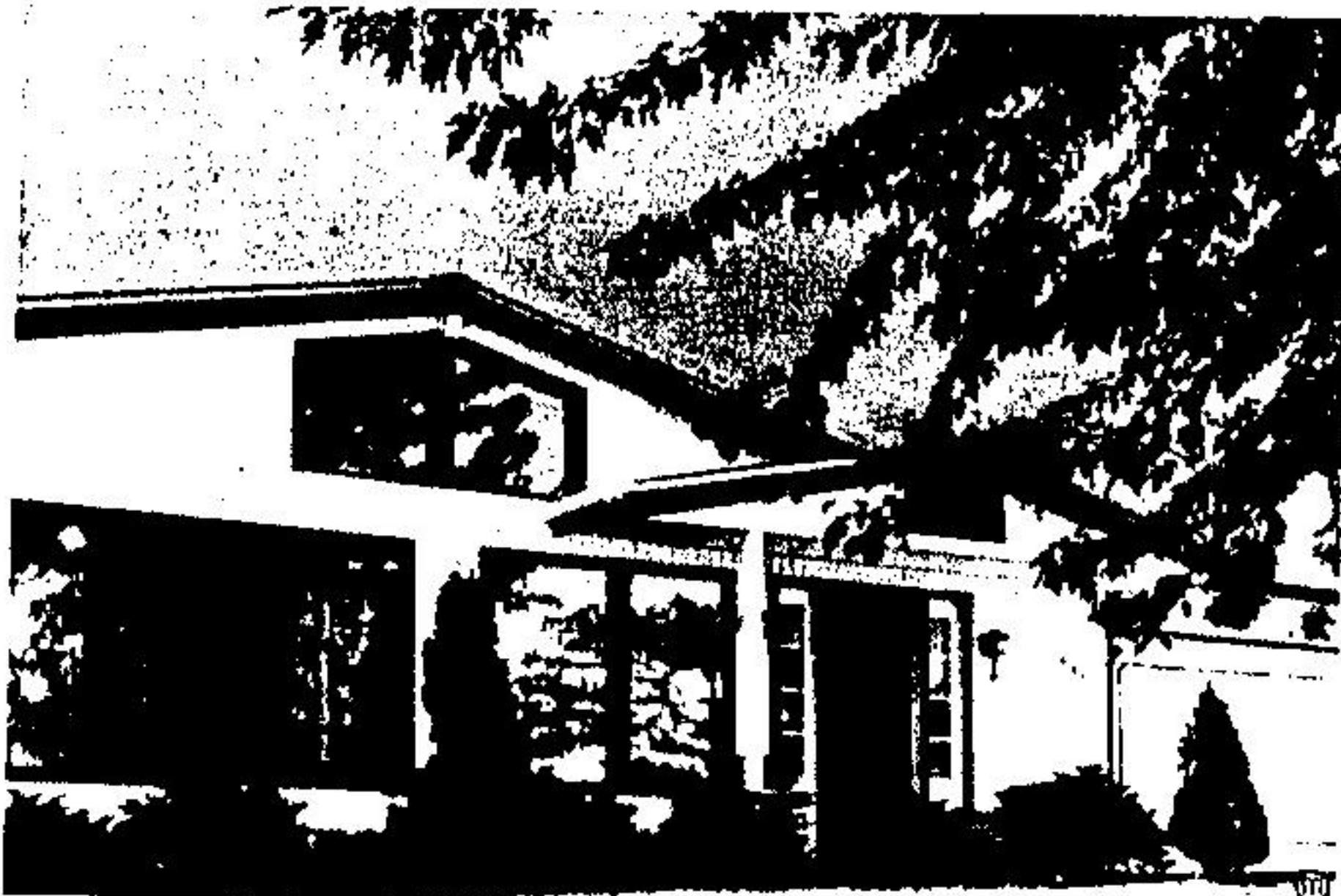
ARCHITECTURAL FEATURES of a house can be highlighted by painting trim, doors and eaves in contrasting colors.

Paint has always been an economical way to increase the value of a house and that is still true today. Despite being an industry greatly affected by petroleum price fluctuations, paint has remained a bargain buy.