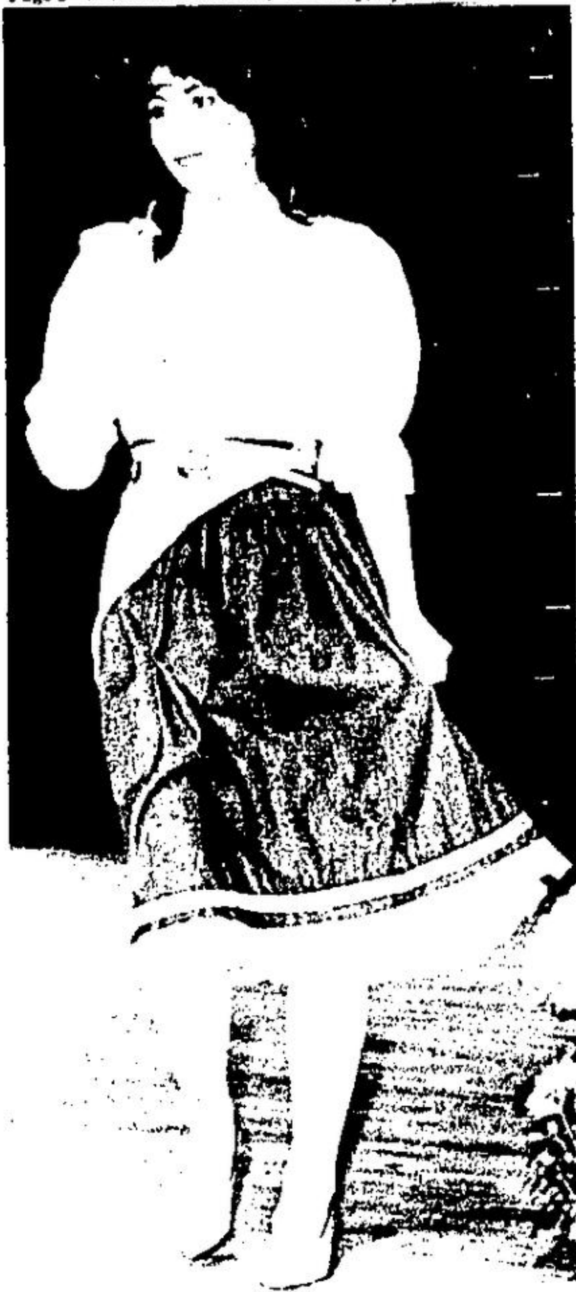
SIGN OF SPRING

That's fashion! About 150 women watched as clothing and accessories from Frills, Teller's Cage, The Village Shoppe and Boughton's were modeled in a fashion show sponsored by the Georgetown Memorial Hospital's Auxiliary Committee. Bright colors, stripes and marine styles predominated. The country look above features a denim skirt with lace edging and a draped scarf about the waist held in place with a coach belt.