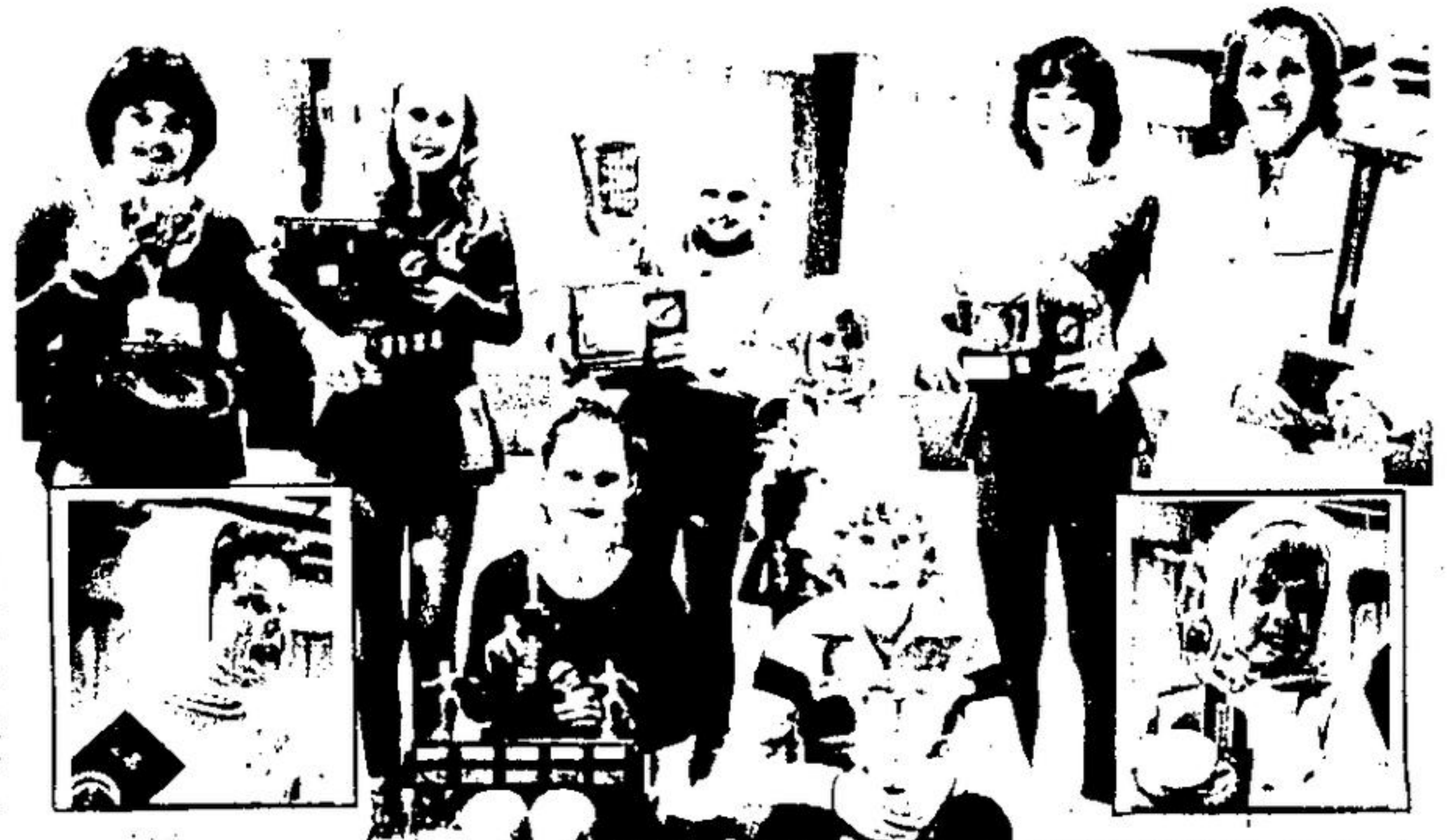
SECTION B, THE HERALD, Wednesday, April 7, 1982 - Page 1