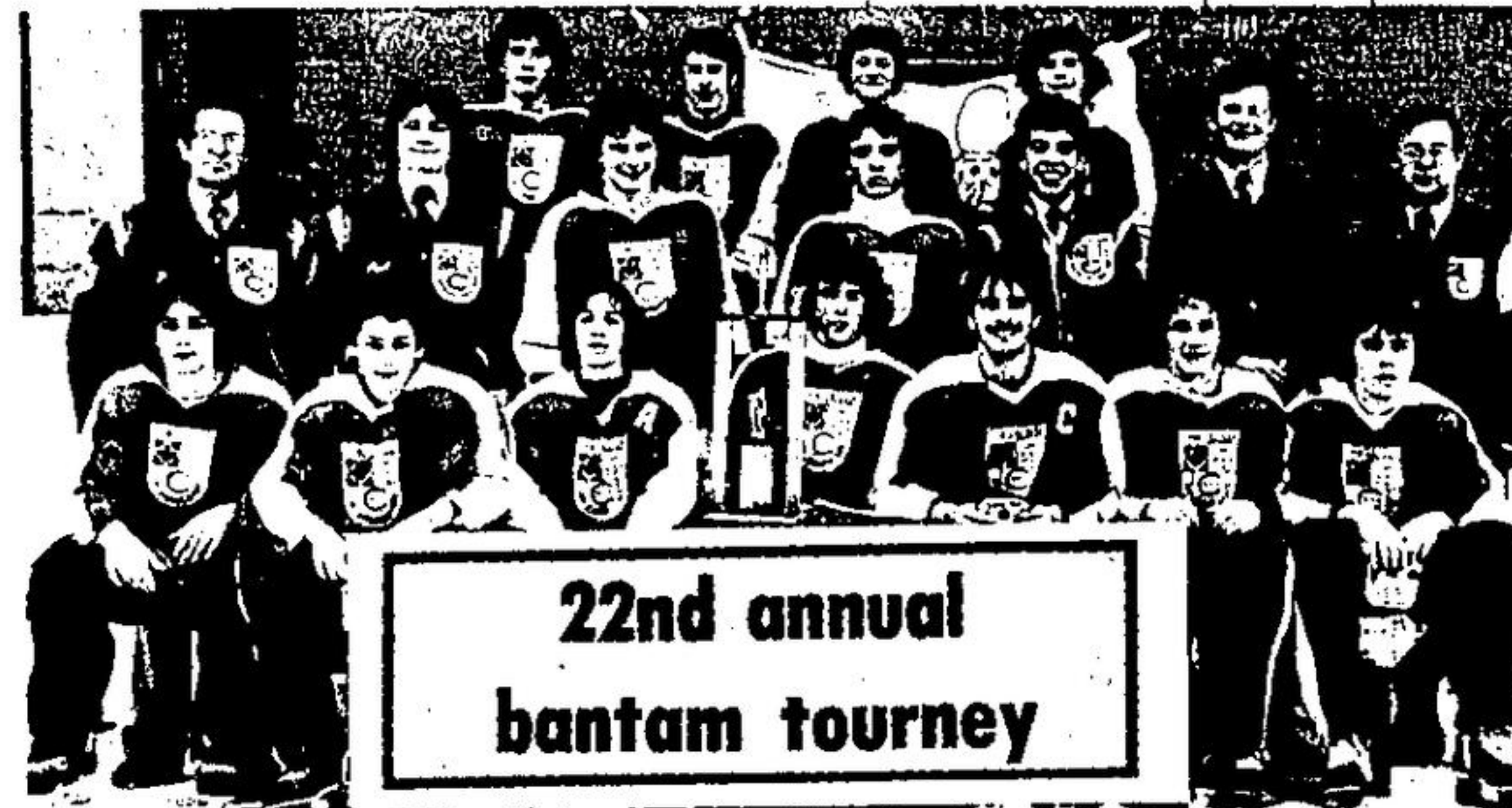
In the B division final, Chinguacousy (seen above) defeated Georgetown 4-0