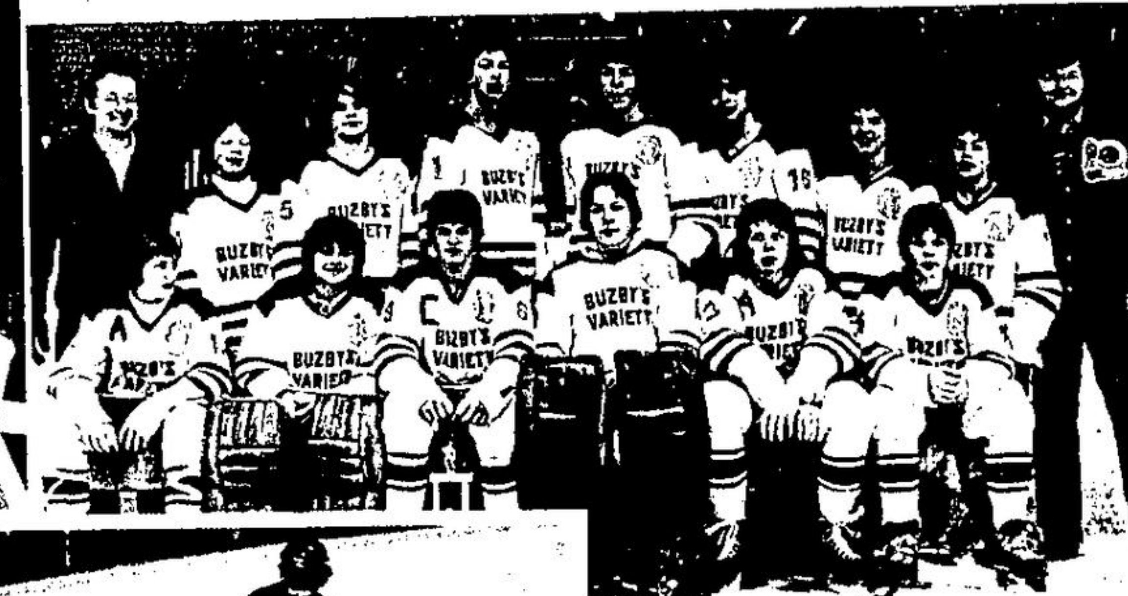
In the C division final, Merrittton (seen above) defeated Bolton 3-2