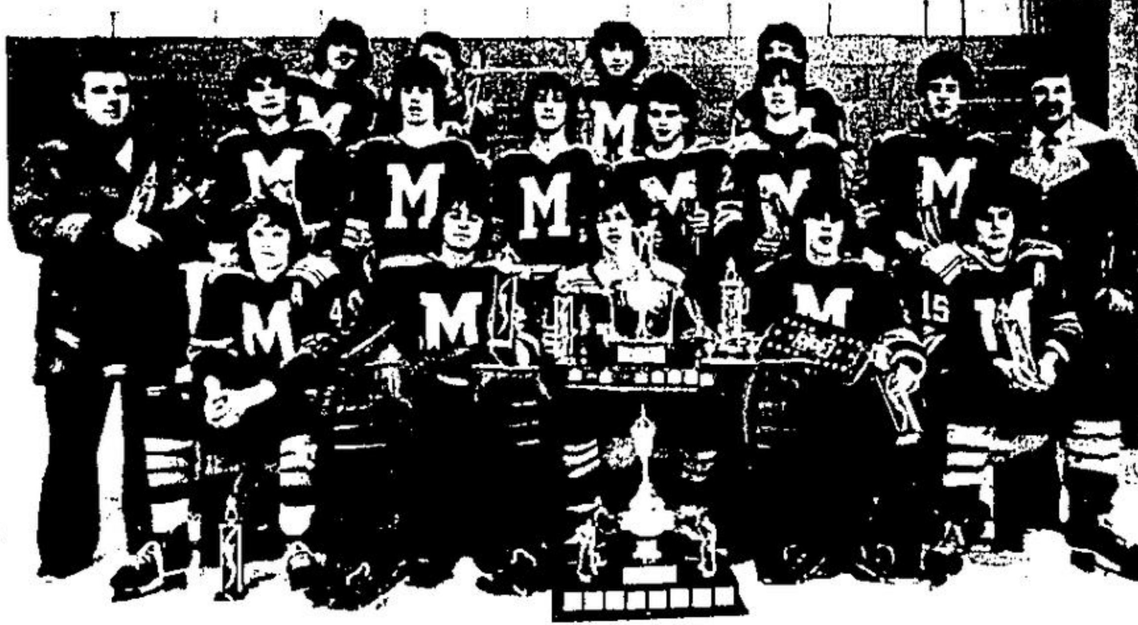
In the A division final, St. Mike's (seen above) defeated North York 3-2