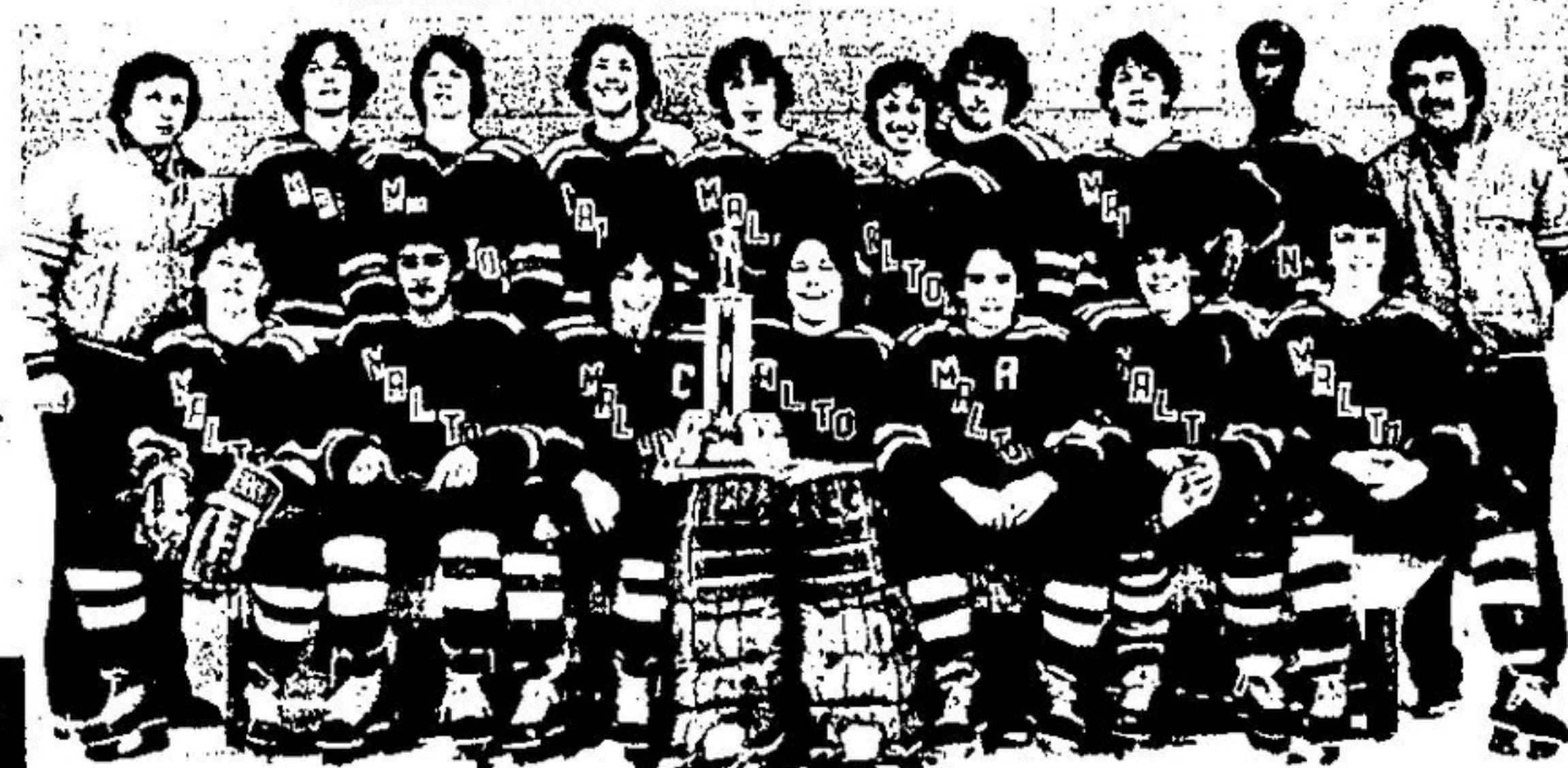
In the D division final, Malton (seen above) defeated Copper Cliff 4-1