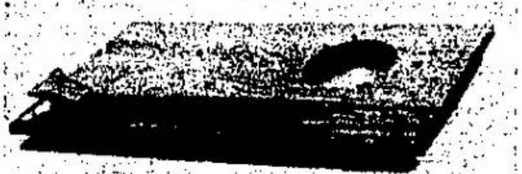
A new cutting board or rather, Fish Cleaning station by Normark.

This is the 35th annual sportsmen's show and much effort has gone into making it worth while attending. Friday, opening day, was a record in attendance for that day and I am sure Saturday was also a record. The Outdoor Writers of Canada hold an annual meeting at the show, and awards are presented at that time. The Francis H. Kortright awards