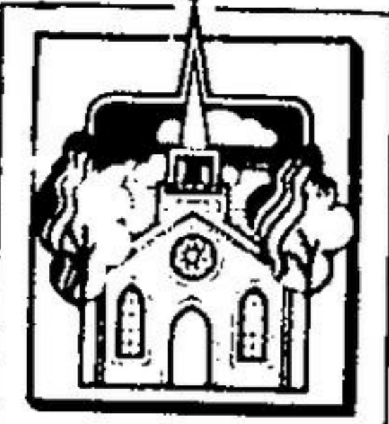
Twenty-eighth in a series

Although an accepted Presbyterian church policy since 1956, it wasn't until this past Christmas that Norval Presbyterian elected women elders and women members to its board of management.