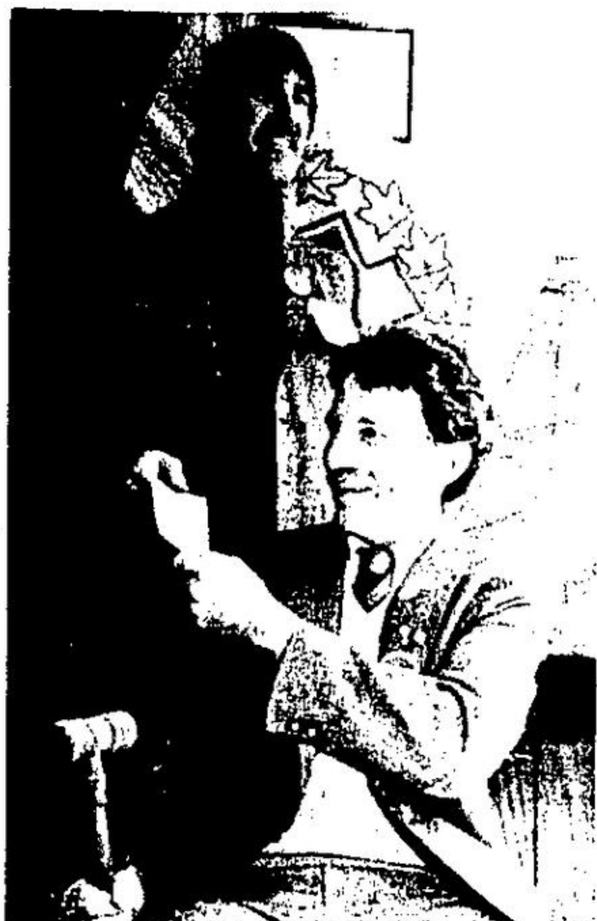
GOIN' FOR THE PASS