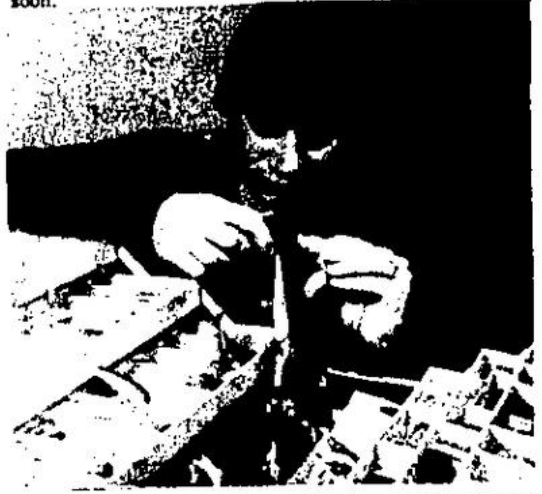
Unangling the mess in your fish box would be a good idea before the season opens.

Sportsmen cut browse and purchased grain in the effort to help our wildlife survive the heavy snow conditions. Next week a complete run down on the Sportsmen's Show that opens on March 19th. Sap is running and the various conservation areas have programs now and starting soon.